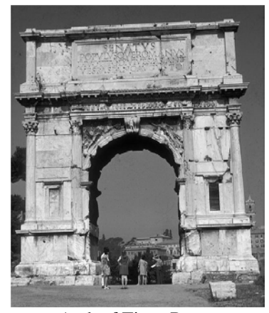
Arch of Titus, Rome