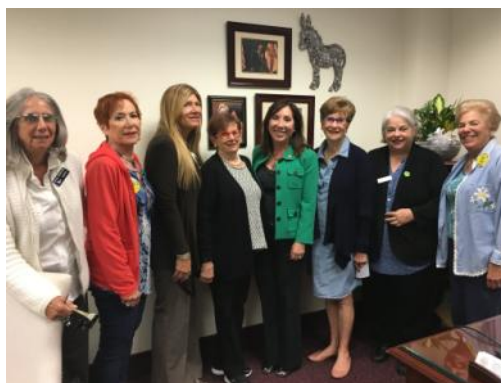
NCJW members with State Senator Laurie Berman (in green jacket)