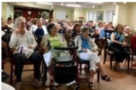
Our full house enjoys the program