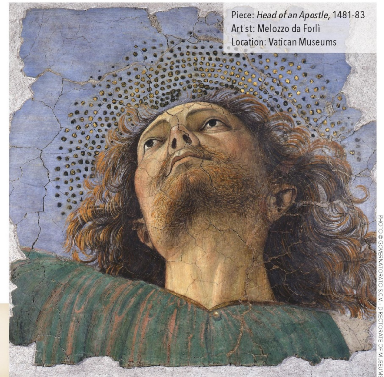
Piece: Head of an Apostle, 1481-83 Artist: Melozzo da Forlì Location: Vatican Museums