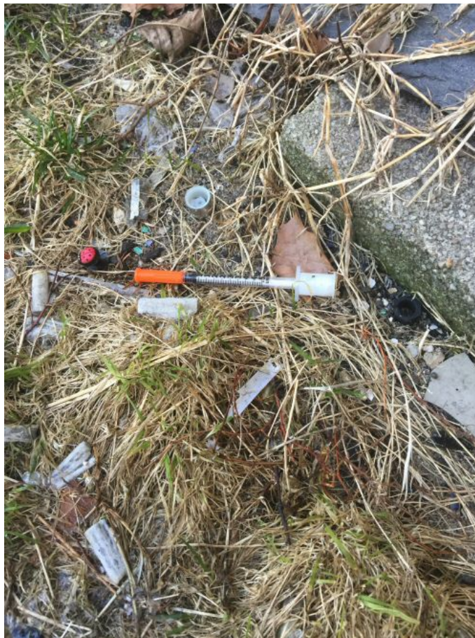
PHOTO: Discarded syringes are common site in Jersey Shore communities.

ASBURY PARK, NJ – Drug overdose deaths at three times the national average, discarded syringes in communities and public consumption of drugs in New Jersey are all solvable issues with proven harm reduction strategies. The problem: these programs don't exist or worse, they sit inactive, as is the case of Asbury Park's Syringe Access Program.