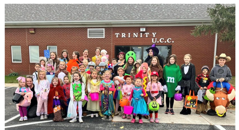
2022 Boo Fest & Trunk -or - Treat