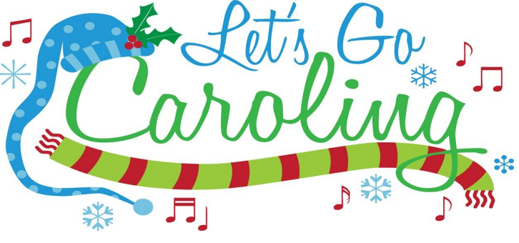
December 11<sup>th</sup> @ 4:00 pm Donations of Cookies will be needed