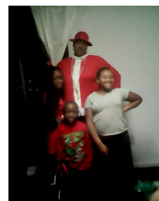
“Grandma Santa Claus”

Yes, scriptural principles applied in any life can be life altering...and that is what our shelter program is all about.