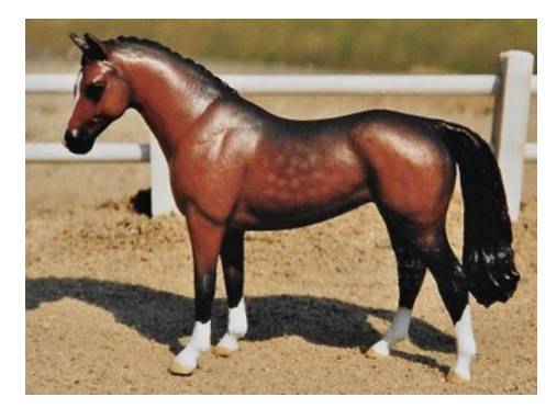
CHAMPION SIMPLE REMAKE/RE-PAINT/HAIR OR SCULPTED MANE/ TAIL: GOING FORMAL (BR)

Simple Remake & Repaint w/Non-Hair Mane/Tail: Smaller than Classic (4): 1-Going Formal (BR), 2-Not Now Ni-san (AC), 3-Nightshade Primrose (HC), 4-WV Cotton Top (AL)