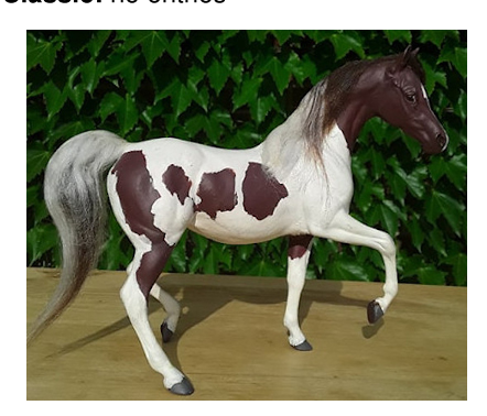
CHAMPION REPAINT/HAIR OR SCULPTED M/T: SHIFTING SANDS (SS)

Repaint w/Non-Hair M/T: Classic and Repaint w/Non-Hair M/T: Smaller than Classic: no entries