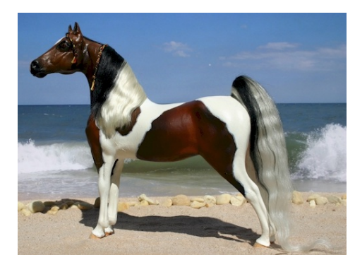
RESERVE CHAMPION GAITED BREED: TS MISSY BROWN (MP)

Clydesdale/Shire (23): 1-Willoughby (MH), 2-TS Bonnie Red (MP), 3-SR Mighty Mo (SS), 4-PR Burning Blue Soul (JV), 5-Zargi (LeB), 6-Bold Masterpiece (LeB), 7-RAS Elian Demoiselle (CM), 8-Deloyer Starblazer (AC), 9-Drambuie (BR), 10-Moody Shires (AI), HM-December Rose (RG)