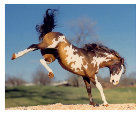
RES. CHAMPION EXTREME REMAKE/ REPAINT/HAIR OR SCULPTED MANE/ TAIL: BLOODBATH HIGHWAY (CV)