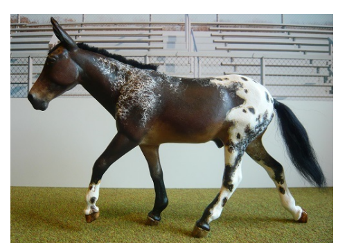
CHAMPION OTHER COLOR: DA BARDIGANO HONEST JOHN (JV)

Fantasy Color (4): 1-TS Ramoth Of Riell (MP), 2-Prince Harry (HC), 3-Hikaze (CV), 4-Liyr (CV))