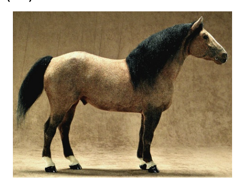
RES. CHAMPION DRAFT BREED: TUG HILL BY REQUEST (CM)

American Pony (7): 1-Brookridge Danton (CV), 2-Wrang Bo Deedy (AC), 3-Diamond Playtime (CM), 4-Black Hand (CV), 5-Jokers Dice (AC), 6-Lady Jessica (CV), 7-Scout (AC)