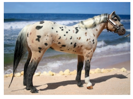
CHAMPION FLOCKED/OTHER CUSTOM: TS IAMA SUNSTORM (MP)

Any Other CM Not Listed Above (17): 1-Dark Naoto's Li'l Squeak Toy Riot (AC), 2-Camden Shamrock (AC), 3-Get Your Groove On (JC), 4-Cloud 9 (MH), 5-Ima Jetalino (SR), 6-Dream All Day (AI), 7-Prince Harry (HC), 8-Elite Colors (CV), 9-Frog Haunting (SR), 10-Shamrock Elfin Magic (SS), HM-Fascinatin' Rythm (LeB)