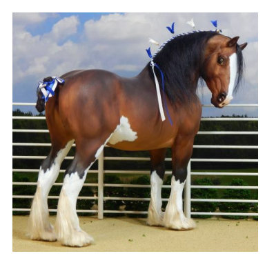
RESERVE CHAMPION DRAFT BREED: WILLOUGHBY (MH)

American Pony (24): 1-Dark Naoto (AC), 2-Rio Lobo (MH), 3-Speed Trap (AI), 4-Hot To Trot (MH), 5-Siri's Sly Delilah (AC), 6-Abayo Fly Bye (AC), 7-CLF Raindance (AI), 8-Ambrosea (CM), 9-Exclusive Threads (LeB), 10-Cricket (MH)