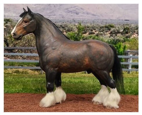
CHAMPION MAJOR REMAKE/RE-PAINT/HAIR OR SCULPTED MANE/ TAIL: SO CZAR IVAN (LeB)

Major Remake & Repaint with Non-Hair Mane/Tail: Smaller than Classic (6): 1-Shez Candu (HC), 2-Viper Mad Blues (CV), 3-Boris Badenov (CV), 4-Midnight Monarch (CR), 5-Bronze Idol (SS), 6-Imagine That (SR)