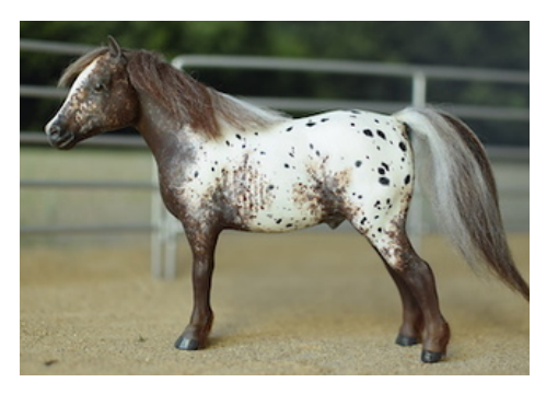
CHAMPION PONY/MINIATURE HORSE: PINE SISKIN (AI)

Other Pure or Mixed Pony Breed (13): 1-Northern Fleet (LeB), 2-FS Snowfell (KO), 3-Althea (SR), 4-Tug Hill Minstrel (CM), 5-The Country Girl (LK), 6-Tug Hill Pied Piper (CM), 7-Ravi Stones (CV), 8-ZI Kismet (AI), 9-Condo Full Colour (AL), 10-Candlelyte Memory (CV), HM-Millers Golden Boy (AL)