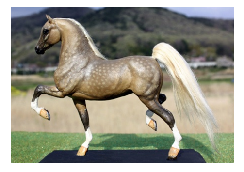
CHAMPION OTHER COLOR: PENNY DREADFUL (AC)

Fantasy Color (5): 1-The Scepter (AC), 2-Rheanth (AC), 3-Aquarion (AC), 4-Carosel (HC), 5-Phantom F Harlock (AC)