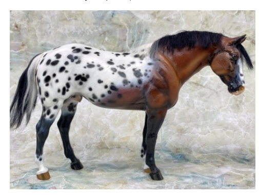
CHAMPION PATTERNED COLOR: NANTY NARKING (SC)

Other Pinto Patterns (75): 1-Indigo Eyes (AC), 2-Splasha Red (CM), 3-Bloodbath Highway (CV), 4-Seiya (AC), 5-Alamance (EH), 6-Ms Kittyhawke (CM), 7-Deloyer Jodevin (AC), 8-Pampapaul IV (JV), 9-Jetarebel (LD), 10-Far Stars Burn (AC), HM-Khaki Style (LeB)