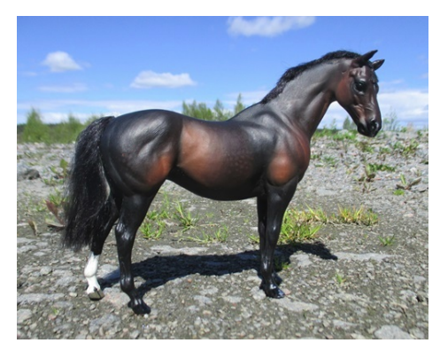
RESERVE CHAMPION SIMPLE REMAKE/ REPAINT/HAIR OR SCULPTED MANE/ TAIL: WALTZING MATILDA (AC)

Major Remake & Repaint w/Hair Mane/ Tail: Trad. or Larger (93): 1-Barrichello Quickstep Alibi (JV), 2-Dee's Sophisticated Lady (MH), 3-Zamboni (HC), 4-TS Desert American Queen (MP), 5-Willoughby (MH), 6-DO Babbington Beauregarde (JV), 7-Mars Flash (AC), 8-D.O. Gunsmoke (MH), 9-D.O. Roan Rocket (MH), 10-D.O. National Anthem (MH), HM-Ima Rock-a-teer (CM)