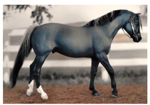
Geldings (2): 1-Sweet William J (CM), 2-Witchita Rock (CM)

Foals (1): 1-Eye Twinkler (NF) [pictured at top of next column]