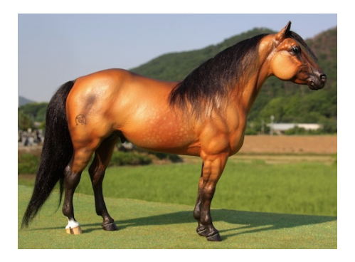
CHAMPION CREAM/DUN: RUMBLEREX (SM)

Dun/Grulla (18): 1-Rio Lobo (MH), 2-Mo' Better Blues (JV), 3-Butterfly Kiss (JV), 4-D.O. Dun Right (MH), 5-MN Borg (LeB), 6-Speed Trap (AI), 7-Ragnarok Hyoga (AC), 8-Abraxas (AC), 9-Lykke (AC), 10-Atom Vinter (AC), HM-TS Grassland Sunrise (MP)