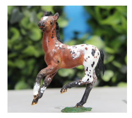
RESERVE CHAMPION FOAL: DAN-CING RAIN (AC)

1980s BREED DIVISION OVERALL CHAMPION: SO CZAR IVAN (LeB)