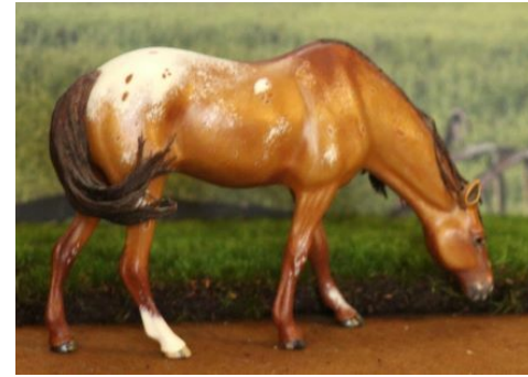
CHAMPION REPAINT/HAIR OR SCULPTED MANE/TAIL: REMEM-BERANCE (HC)

1-Rememberance (HC), 2-J's Sweetbriar (AI), 3-Remember Me Too (HC)