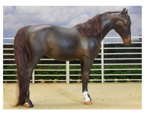
RES. CHAMPION REPAINT/HAIR OR SCULPTED M/T: MOMENT OF CHANCE (MH)

Simple Remake & Repaint w/Hair M/T: Trad. or Larger (8): 1-Nhi Vanye I Chyya (LB), 2-Cutter's Pokey Pine (CM), 3-Tejas Little Eagle (CM), 4-Metallic KO (AI), 5-Diamond Red Hawk (CM), 6-Encantadora (MH), 7-Polaris (SS), 8-Fantasia's Silver Radiance (AC)