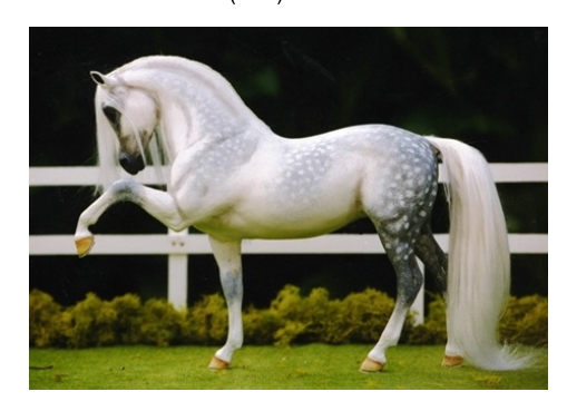
CHAMPION SPANISH BREED: PR ELDORADO SPANISH ROSE (JV)

Other Pure or Mixed Spanish Breed (19): 1-D.O. Gunsmoke (MH), 2-LJ Zorro (MH), 3-Malegena (CM), 4-Better Than Diamonds (MH), 5-Cielo Azul (HR), 6-D.O. Sportin' Chance (MH), 7-Elusive Vision (SS), 8-Siglavy Seiko (CV), 9-Encaje (SS), 10-Gateado Mancho (AC), HM-TS Picante (MP)