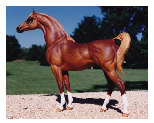
CHAMP REPAINT: ASUKA RYO (AC)

4-Crimson Song (LeB), 5-Fall Sunrise (LeB), 6-Encaje (SS), 7-Buckshot (HC), 8-Moorland Monarch (JV), 9-Baked Alaska (SR), 10-Bold Masterpiece (LeB), HM-Drambuie (BR)