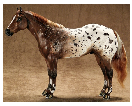
(JV), HM- *Enyaa (CV)

Arabian (63): 1-Asuka Ryo (AC), 2-WV Elegance Can Wait (LeB), 3-Ahvaz Zofia (CR), 4-Ahtohallan (AI), 5-Sea of Storms (CV), 6-D.O. Baccarat (MH), 7-Bint el Rosetta (LK), 8-Mistress Nine (CV), 9-Kastella (MH), 10-PR Nazeem Al-Ashab