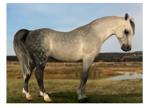
CHAMP REPAINT: EVENSTAR (SR)

Repaint: Smaller than Classic (15): 1-Evenstar (SR), 2-Vajna (BR), 3-En Fuego (CR), 4-DQ Jim Dandy (SS), 5-Far Horizon (LeB), 6-Big Bang Theory (SR), 7-Indigo (KO), 8-Banned From Argo (AC), 9-Spotted Sponge (LeB), 10-Idaknow (LeB), HM-Bito Babe (AC)