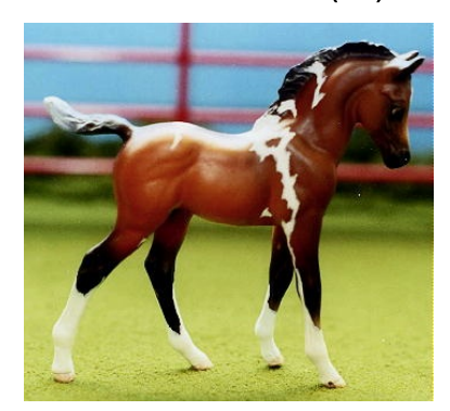
RES. CHAMPION CUSTOM WITH FACTORY PAINT: MERIDIA (LeB)

Repaint: Traditional or Larger (47): 1-Asuka Ryo (AC), 2-Brimstone (JC), 3-Pearl Essence (CM), 4-LJ Waikikamukau (AL), 5-Charisma (LeB), 6-Lady Yelena (LeB), 7-November Rain (BR), 8-*Komment (SS), 9-Ella Enchanted (AI), 10-Apache Kid (SR), HM-Blue Tower (MH)