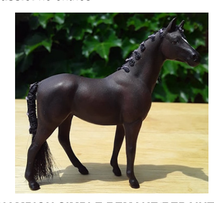
CHAMPION SIMPLE REMAKE/REPAINT/ HAIR OR SCULPTED MANE/TAIL: *LORD FAIRFAX (SS)

Simple Remake & Repaint w/Non-Hair M/T: Traditional or Larger and Simple Remake & Repaint w/Non-Hair M/T: Smaller than Classic: no entries