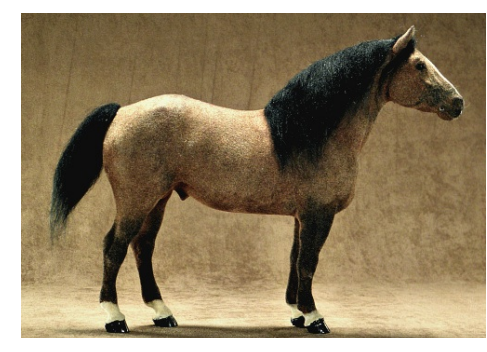
CHAMPION FLOCKED/OTHER CUSTOM: TUG HILL BY REQUEST (CM)

Any Other Customization Not Listed Above (8): 1-Attn Evildoers (AC), 2-Akasha (SM), 3-Tiny Harper (AC), 4-Cebion (MH), 5-Florascope (CV), 6-Millennium Falcon (AC), 7-Seventh Moon (AC), 8-Stray Kat Strut (AC)