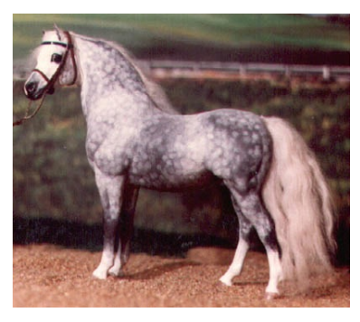
RES. CHAMPION MAJOR REMAKE/ REPAINT/HAIR OR SCULPTED M/T: WICKENDEN OSPREY (AC)

Extreme Remake & Repaint w/Hair M/T: Trad. or Larger (10): 1-Kandu Koho (AC), 2-Diamond Seonee (AC), 3-Rockledge Diamond Lark (CM), 4-Diamond Fancy Cat (CM), 5-Khedija (SS), 6-Courtrai (MH), 7-Charleroi (MH), 8-Battleshoe Lori (AC), 9-DQ Bint Rafflesia (AC), 10-Handsome Stranger (SS)