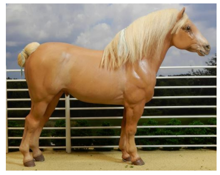
CHAMPION DRAFT BREED: CHARLEROI (MH)

Other Pure/Mixed Draft Breed (1): 1-Tug Hill By Request (CM)