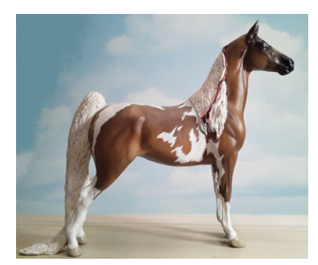
CHAMPION MAJOR REMAKE/REPAINT/ HAIR OR SCULPTED MANE/ TAIL: D'S DAKOTA FRILLS (SS)

Major Rem./Rep. w/Non-Hair M/T: Smaller than Cl. (13): 1-Lykke (AC), 2-Northern Exposure (BR), 3-Moonlight Cocktail (CV), 4-Cast Iron Slew (AI), 5-Strange Meadowlark (AC), 6-Bonfire Vision (LeB), 7-Vijelie Noptii (BR), 8-In Lieu Of Cartier (BR), 9-Cast Iron Bull (AI), 10-WBP Jolly Roger (LeB), HM-Majestic Ziggy (AL)