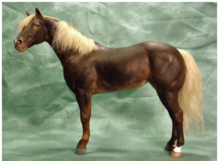
Desert Rose (SS), 10-*Quest (AC), HM-Cebion (MH)

Part-Arabian (16): 1-Asakura Condor (AC), 2-Shifting Sands (SS), 3-Transmute Condor (AC), 4-Khemo's Silouette (CV), 5-Khedija (SS), 6-Kando Koho (AC), 7-Hatahei (CV), 8-Jeet Kune Do (LD), 9-Polaris (SS), 10-Sunrise Enchanter (SS), HMs-Faleen (SS)