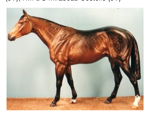
CHAMPION SPORT BREED: BRIMSTONE (JC)

Other Pure or Mix Sport Breeds (25): 1-The Bluesmobile (AC), 2-Jigen (AC), 3-Nafzieger (BR), 4-Solid Citizen (CM), 5-Kamtara Colorado Autumn (JV), 6-PR Murphy Brown (JV), 7-PR Wharram Percy (JV), 8-Fiesta Time (SS), 9-PHF Modesty Blaise (JV), 10-Seldovia Broadway Star (JV), HM-DO Mirabeau Costello (JV)