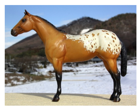
RES. CHAMPION CUSTOM W/FACTORY PAINT: BANG IPPONGI (AC)

Repaint: Trad. or Larger (50): 1-Loftus Jones (LB), 2-Hobo's Lullaby (AC), 3-Wild Eagle (LB), 4-Khaki Style (LeB), 5-Montana Cat (LB), 6-Abba (JC), 7-Such Are Promises (AC), 8-Castlekeep Mistress (LB), 9-Avalanche (CV), 10-Above The Rest (AC), HM-All Aflame (AC)