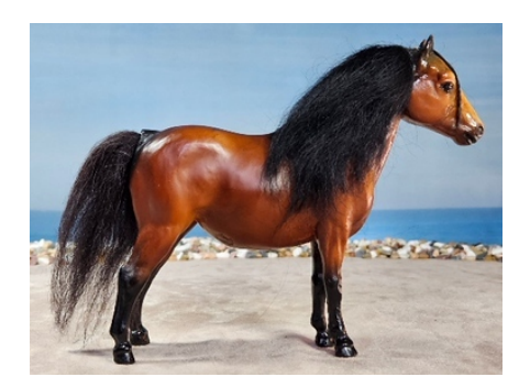
CHAMPION CUSTOM W/FACTORY PAINT: DEONNA (LeB)

Retouch/Partial Paint Removal/Etch on Factory Paint w/Non-Factory Mane/ Tail and Remake and Retouch/Partial Paint Removal/Etch on Factory Paint w/Non-Factory Mane/Tail: no entries