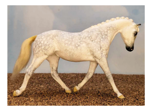
CHAMPION PONY/MINI HORSE: REDWINGS GABRIELLE (SS)

3-Lykke (AC), 4-Abraxas (AC), 5-MN Borg (LeB), 6-Moorland Monarch (CR), 7-I Tolt You So (SC), 8-Shane (KO), 9-TS Catching The Sun (MP), 10- Island Baron (AI), HM-Dakota Rose (JV)