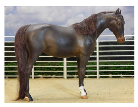
RES. CHAMPION SPORT BREED: MOMENT OF CHANCE (MH)

Paso Fino/Peruvian Paso (1): 1-Trigger Mortis (AC)