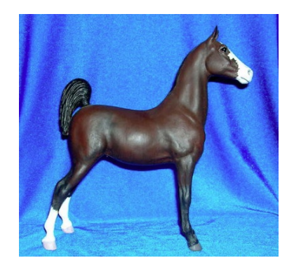
RES. CHAMPION FOAL: WOODLAND GYPSY (CV)