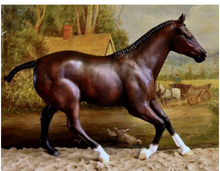
RES. CHAMPION EXTREME REMAKE/ REPAINT/HAIR OR SCULPTED MANE/ TAIL: DARK PHOENIX (SS)

Flocked w/Flocked Mane/Tail (2): 1-Banshee (LD), 2-Moment in Time (CV)