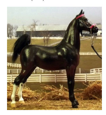
CHAMPION FOAL: LJ POP TART (MH)

Longear/Exotic/Fantasy Foal (3): 1-J's Dandylion (AI), 2-Strange Tayls (AC), 3-Butterscotch (RB)