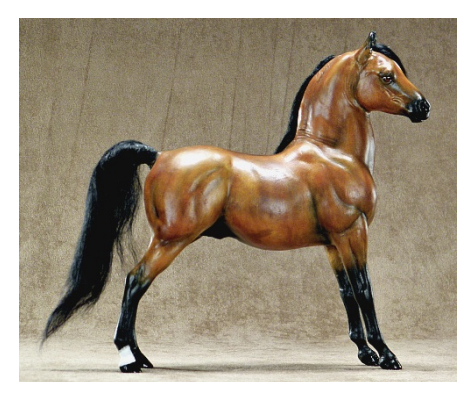
RESERVE CHAMPION BASE COLOR: TUG HILL MINSTREL (CM)

Dapple Grey (90): 1-Jamil Mhuratt (CR), 2-Classic Girl (LD), 3-Mon'Nafa Rani (CR), 4-DW Jethro (CR), 5-Evenstar (SR), 6-Dancing in the Rain (RG), 7-Soldier Blue (AC), 8-Anise (BR), 9-Bittersweet (CV), 10-Castlekeep Mistress (LB), HM-Little Sizzler (LeB)