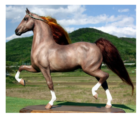
CHAMPION GAITED BREED: SLAM-DUNK DIAMOND (AC)

Other Pure or Mixed Gaited Breed (10): 1-Wicked Speedia (AC), 2-D.O. Designer Colors (MH), 3-AMB Midnight Frosty (AC), 4-Gold Standard (AC), 5-Flashdancer (AC), 6-Quaint Keaton (AC), 7-Mr. Majestic (SS), 8-Gentleman Jim (SS), 9-Palomar Poco Lolita (JV), 10-Wings of Magic (AC)