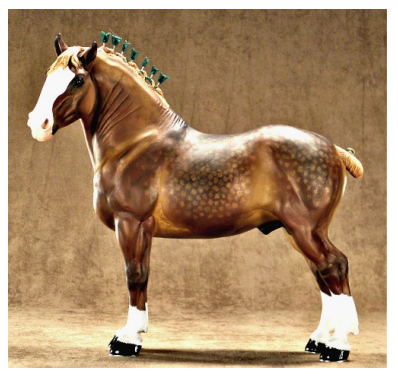
CHAMPION BASE COLOR: LE COMTE DE MONTE CRISTO (CM)

Black (16): 1-Summer Of Night (AC), 2-Vijelie Noptii (BR), 3-Dominion (SS), 4-Beltrane (SR), 5-Musette (CV), 6-Dancer (HC), 7-KA Flight of Fancy (JV), 8-Talula (SR), 9-RM Calliope (CV), 10-Midnight's Mac (CV), HM-PC Fergus (CM)