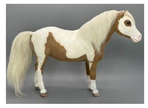
CHAMPION FLOCKED/OTHER CUSTOM: ENCHANTED MIST (RB)

Any Other Customization Not Listed Above (15): 1-Waters Under Earth (CV), 2-Monkey Doodle Doo (CV), 3-Verano Sombra (SS), 4-Antara Appalonia (LB), 5-Poco Ladybug (CV), 6-Khehana (KO), 7-Ysengrin (AC), 8-La Cienka (AR), 9-Sweet Dreams (LeB), 10-Phoenixbrook (AC), HM-Gentleman Jim (SS)