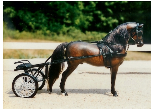
1960s/1970s Vintage Custom Breed Division

Quarter Horse (7): 1-Cutter's Pokey Pine (CM), 2-Indiana Jones (LB), 3-Diamond Fancy Cat (CM), 4-Poco Graybar (LB), 5-Metallic KO (AI), 6-Speedy Gonzales (CV), 7-Shine On Shoshoni (SS)