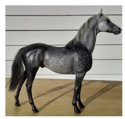
RES. CHAMPION REPAINT/HAIR OR SCULPTED M/T: IRON EAGLE (SS)

Simple Remake & Repaint w/Hair M/T: Traditional or Larger (86): 1-PR Murphy Brown (JV), 2-D.O. Raindance (MH), 3-D.O. Baccarat (MH), 4-Seonee Elegy (AC), 5-Regina Kashmir (BR), 6-Amantus VS (SR), 7-Sir Octane (CV), 8-Ahtohallan (AI), 9-B'wa Nina (CV), 10-Slick Drifter (MH), HM-D.O. Chantilly Lace (MH)