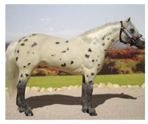
1990s WORKMANSHIP DIVISION OVERALL CHAMPION: LE COMTE DE MONTE CRISTO (CM)

1990s WORKMANSHIP DIVISION OVERALL RESERVE CHAMPION: PR MURPHY BROWN (JV)