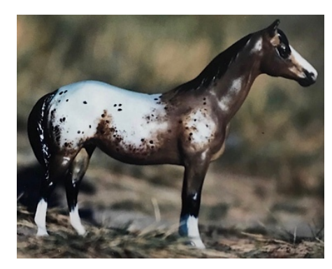
CHAMPION PATTERNED COLOR: CASCADE MAIDEN (LK)

Other Pinto Pattern (10): 1-The Pied Viper (AC), 2-Scout (AC), 3-Hatahei (CV), 4-Singing Grass (CV), 5-Melulu (CV), 6-Flashover (SS), 7-Jeet Kune Do (LD), 8-Maharajah (LD), 9-Triton Too (SS), 10-Polaris (SS)