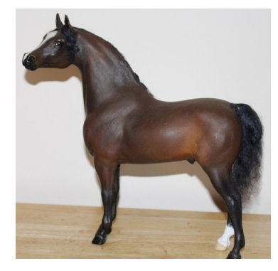
RESERVE CHAMPION SIMPLE RE-MAKE/REPAINT/HAIR OR SCULPTED MANE/TAIL: NHI VANYE I CHYYA (LB)

Major Remake & Repaint with Hair M/T: Trad. or Larger (12): 1-Wickenden Osprey (AC), 2-Brookridge Diamond (LB), 3-Rocking Chair Renegade Revel (CM), 4*Quest (AC), 5-High Chaparral (CV), 6-Ansata Sisu (HR), 7-Telemann (LB), 8-Indiana Jones (LB), 9-El Asombro (MH), 10-Jokers Dice (AC), HM-Melulu (CV)