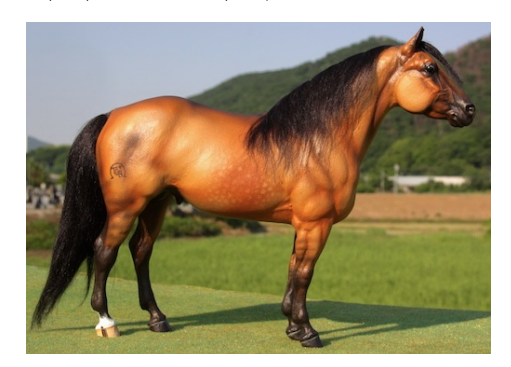
CHAMPION STOCK BREED: RUM-BLEREX (SM)

Other Pure or Mixed Stock Breed (17): 1-RumbleRex (SM), 2-DO Sabre Dance (MH), 3-DO Ridge Runner (MH), 4-Nemesis (LeB), 5-DO Copper Dust (MH), 6-Polished Image (LeB), 7-Lacey Lady (MH), 8-Strange Meadowlark (AC), 9-D.O. Dun IV (JV), 10-Marshall Mellow (SC), HM-Jimini (MH)