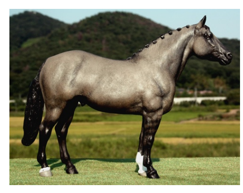
RESERVE CHAMPION CREAM/ DUN COLOR: TADEUSZ (AC)

Blanket Appaloosa (17): 1-Cascade Maiden (LK), 2-Lakota Diamond (EH), 3-Scherzazz Diamond (CV), 4-Wrang Bo Deedy (AC), 5-Diamond Seonee (AC), 6-Azure Lady (SS), 7-Clovis (CV), 8-Ahdunit Agin (CV), 9-Jokers Dice (AC), 10-Lady Jessica (CV), HM-Jack Of Hearts (AC)