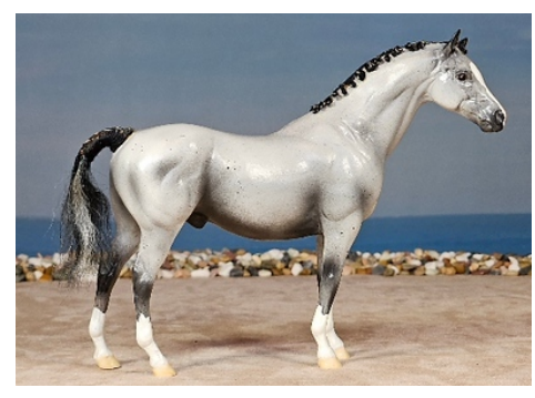
RESERVE CHAMPION REPAINT/HAIR OR SCULPTED MANE/TAIL: NOR-THERN FLEET (LeB)

Simple Remake & Repaint w/Hair Mane/Tail: Trad. or Larger (128): 1-DQ Hail Freedonia (CV), 2-Diamond Itorah (LeB), 3-Splasha Red (CM, 4-Diamond Blue Rose (CR), 5-Alamance (EH), 6-Diamond Joker (MH), 7-Beautiful Noise (LD), 8-Diamond Artemis (CV), 9-Cropton Ark Royal (JV), 10-Asteroid Blues (AC), HM-Alias Jeannie Jones (JC)