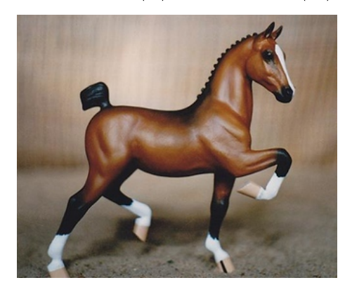
CHAMPION EXTREME REMAKE/RE-PAINT/HAIR OR SCULPTED MANE/ TAIL: CLOCKWORK (LD)

Extreme Remake & Repaint with Non-Hair M/T: Smaller than Classic (5): 1-Whippoorwill Drop Dead Fred (BR), 2-Anise (BR), 3-DQ April Whisper (SS), 4-Queen's Gambit (JC), 5-LL Tidal Wave (SM)