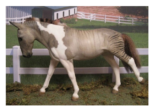
RES. CHAMPION LONGEAR/EXOTIC/ FANTASY: ZAMBONI (HC)

Stock Breed Foal (30): 1-WL Shot in the Dark (LeB), 2-Without A Doubt (AC), 3-Lightning Moon (SS), 4-Luna Halo (AI), 5-Charming Charlie (HC), 6-Calico Cat (SM), 7-Moonchaser (AI), 8-PR Saskatoon Blues (JV), 9-Jettster (AI), 10-Apache Kid (SR), HM-Angel (LB)