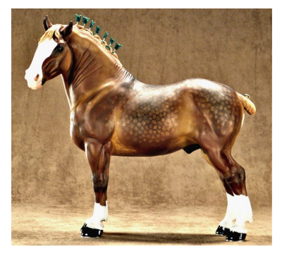
CHAMPION DRAFT BREED: LE COMTE DE MONTE CRISTO (CM)

Other Pure or Mixed Draft Breed (21): 1-D.O. Bessancour Moulin Rouge (JV), 2-Rockford (LeB), 3-Die Rosenkavalier (JV), 4-Atragon (AC), 5-Shoulda Had A Fifth (LeB), 6-Demetrius (LeB), 7-Loic (LeB), 8-WV Heza KO (LeB), 9-KT Le Baron (CV), 10-Tolleshunt Darcy (JV), HM-TS Druid Allanon (MP)