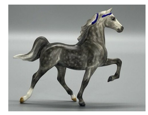
CHAMPION GAITED BREED: SILVER BULLET (RB)

Tennessee Walking Horse: no entries Other Pure or Mixed Gaited (1): 1-Stray Kat Strut (AC)