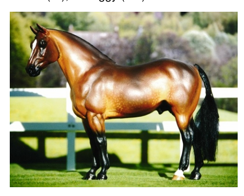
CHAMPION SIMPLE REMAKE/REPAINT/ HAIR OR SCULPTED MANE/TAIL: PR MURPHY BROWN (JV)

Simple Remake & Repaint with Non-Hair M/T: Smaller than Classic (10): 1-Calico Charisma (SM), 2-WBP Frostybites (LeB), 3-Calico Cat (SM), 4-McQueen (LK), 5-Marlayna (SR), 6-Star At Rest (AI), 7-ZI Jedi Jetta (AI), 8-Meghan's Hope (SS), 9-Ice Queen (AI), 10-Ziggy (HC)