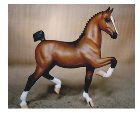
RES. CHAMPION PONY/MINIATURE HORSE: CLOCKWORK (LD)

Longear (4): 1-Sweet Adelaide (CV), 2-Belle Kabong (AC), 3-Ironwood Glenn (SS), 4- O Karen (CV)