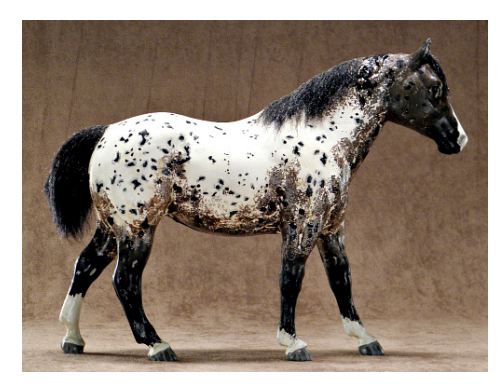
RES. CHAMPION PATTERNED COLOR: TEJAS LITTLE EAGLE (CM)

Longear/Exotic and Other Realistic Color and Fantasy Color: no entries