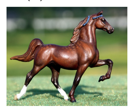
RES. CHAMPION GAITED BREED: STARSHIP PHOENIX (AC)