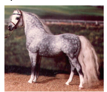
CHAMPION PONY/MINIATURE HORSE: WICKENDEN OSPREY (AC)

Miniature Horse and Other Pure or Mixed Pony Breed: no entries