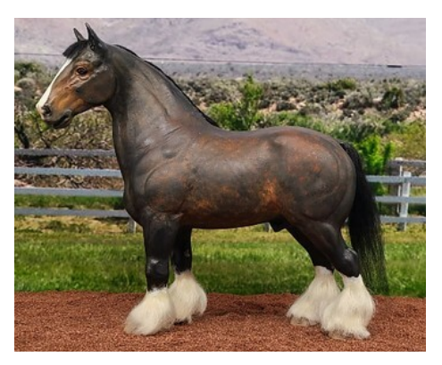
CHAMPION DRAFT BREED: SO CZAR IVAN (LeB)

Other Pure or Mixed Draft Breed (15): 1-So Czar Ivan (LeB), 2-Diamond Faerytale (AI), 3-Kyrie (SR), 4-Freudian Slip (AC), 5-Tetsugyu (AC), 6-Galient (AC), 7-Matsuko DX (CV), 8-Nyx (AC), 9-Finnegan (AC), 10-Poco Ladybug (CV), HM-Captain Lucky (CV)