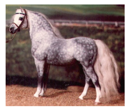
CHAMPION GREY/ROAN: WICKEN-DEN OSPREY (AC)

Roan (3): 1-Poco Graybar (LB), 2-Eagle Sharp (AC), 3-Strawberry Wine (SS)