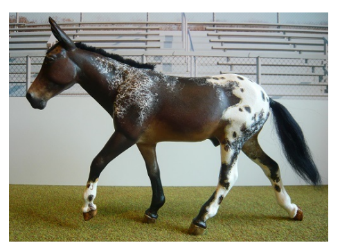
CHAMPION REPAINT/HAIR OR SCULPTED MANE/TAIL: DA BARDI-GANO HONEST JOHN (JV)

Repaint w/Non-Hair M/T: Smaller than Classic (10): 1-Painted Quandry (LeB), 2-Frosted Gold (CR), 3-All Dunn Up (LeB), 4-Bint Amira (CV), 5-Harmonium (LK), 6-CL Fairway (HC), 7-Romeo (CR), 8-London Fog (LK), 9-Treasured Gift (LeB), 10-Tiny Bud (HC)