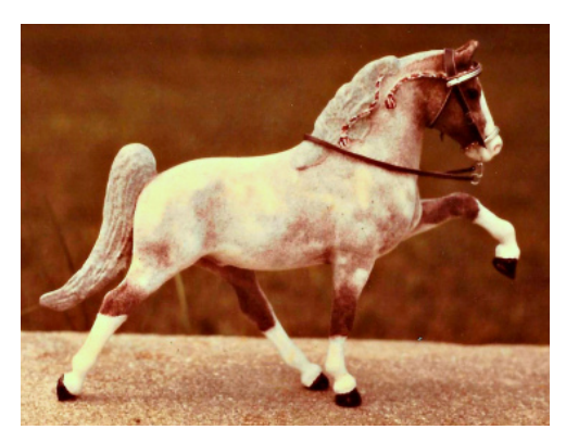
Gaited Breed (1): 1-Roaring Roan (CM)

Light Breeds & Sport & Spanish & Draft & Pony & Longear/ Exotic/Fantasy Breeds : no entries