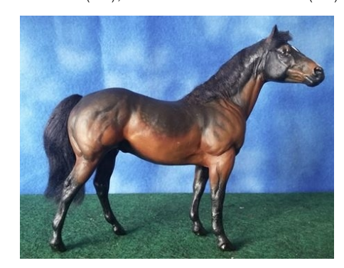
CHAMPION BASE COLOR: BROOK-RIDGE DANTON (CV)

Black (3): 1-*Kara Zayim (AC), 2-Teo Torriatte (LK), 3-Seaside Rendezvous (LK)