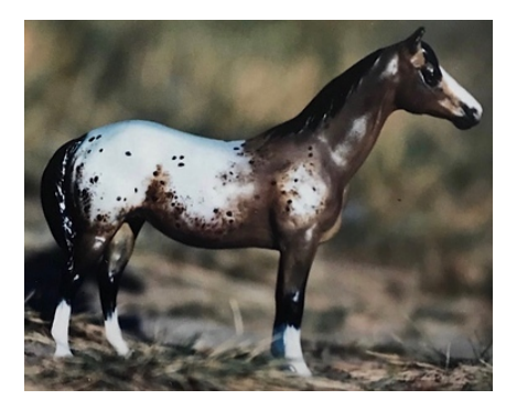
CHAMPION REPAINT: CASCADE MAIDEN (LK)

Repaint: Smaller than Classic Size (5): 1-Starship Phoenix (AC), 2-Silver Bullet (RB), 3-Swinga Pinga (AL), 4-Desert Spirit (RB), 5-Tommy Robin (AC)