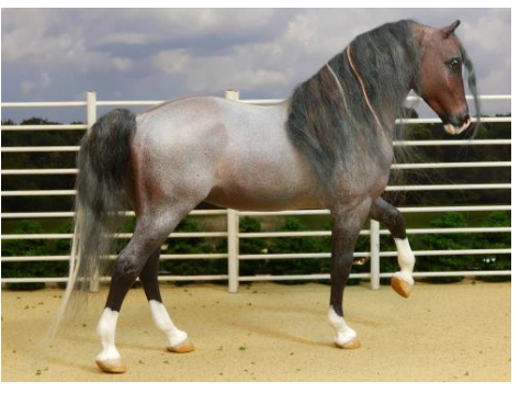
CHAMPION SPANISH BREED: ME BOLIDO (MH)

Other Pure/Mixed Spanish Breed (9): 1-KT Siglavy XI Africa (CM), 2-Nikita Royal (HC), 3-Ima Believer (CR), 4-Pampapaul IV (JV), 5-Pavlova (SS), 6-Maestoso Pavlova (SS), 7-The Cimarron Kid (JV), 8-Xanadu (LeB), 9-TS Aluvame Sunspots (MP)