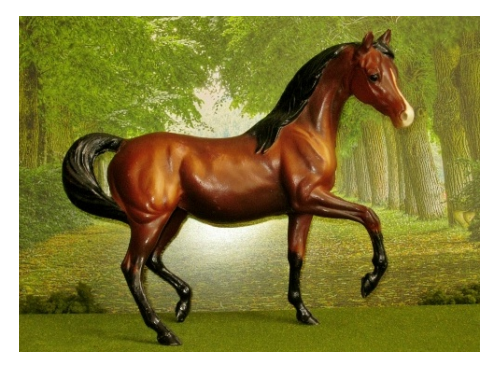
RESERVE CHAMPION CUSTOM W/FACTORY PAINT: FIREO (NF)

Repaint: Trad. or Larger (15): 1-Azure Lady (SS), 2-Clovis (CV), 3-Al Dhahab al'Aswad (SM), 4-Poco Graybar (LB), 5-Trigger Mortis (SS), 6-Woodland Gypsy (CV), 7-Follow The Moonlight (AC), 8-Matar (LB), 9-Shine On Shoshoni (SS), 10-Khemo's Silouette (CV), HM-Speedy Gonzales (CV)