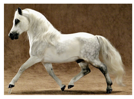
RES. CHAMP PONY/MINI HORSE: CAMELOT'S HOT T' TROT (CM)

Longear (13): 1-DA Bardigano Honest John (JV), 2-Buttered Rum (LeB), 3-Alter Ego (SR), 4-Rhubarb Babe (AC), 5-Richard (MH), 6-Shamrock Elfin Magic (SS), 7-Double Dare (MH), 8-Bilt To Boogie (SC), 9-Churchy LaFemme (AC), 10-Quit Menacing Me (SC), HM-Sunshine's Beebop (HC)