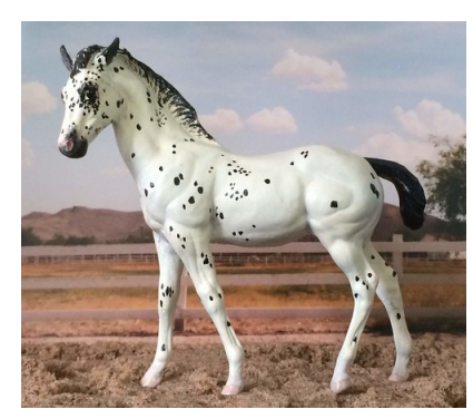
CHAMPION FOAL: NORTHERN LAD (SR)

Draft Foal & Longear/Exotic/ Fantasy Foal: no entries