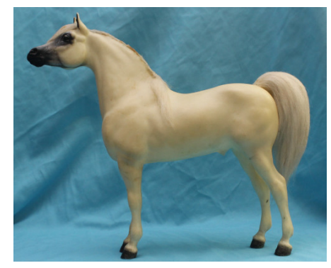
CHAMPION CUSTOM W/FACTORY PAINT: CONSTELLATION'S IMAGE (SS)

Remake and Retouch/Partial Paint Removal/Etch on Factory Paint with Non-Factory Mane/Tail: no entries