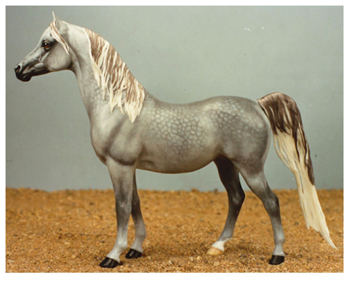
Mares (4): 1-Princesse Silver (KO), 2-Lonesome Dove (CM), 3-DQ Shiaway Jetta (CM), 4-Sherwood Peacock (CM)