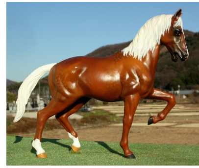
American Saddlebred (2): 1-Silver Bullet (RB), 2-Starship Phoenix (AC)

Tennessee Walking Horse: no entries Other Pure or Mixed Gaited (1): 1-Stray Kat Strut (AC)