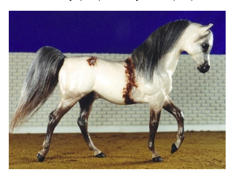
CHAMP LIGHT BREED: MUSTAFA BEY (CV)

Other Pure or Mixed Light Breed (2): 1-Rufus T. Firefly (AC), 2-Tulyaram (NF)