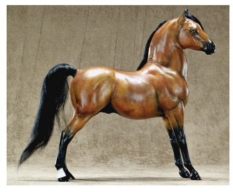
RES. CHAMPION MAJOR REMAKE/ REPAINT/HAIR OR SCULPTED MANE/ TAIL: TUG HILL MINSTREL (CM)

Extreme Remake & Repaint with Hair Mane/Tail: Trad. or Larger (154): 1-Bloodbath Highway (CV), 2-Sophisticated Boom-Boom (CV), 3-Brigante (AC), 4-Deloyer Jodevin (AC), 5-Rosa Luna Sangrienta (MH), 6-*Mirai (CV), 7-Quick Comet (AC), 8-Dow Jones (JV), 9-Antara RM Starbird (AC), 10-Galient (AC), HM-Assassin Slew (AC)