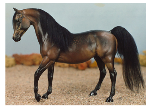
RESERVE CHAMPION SIMPLE RE-MAKE/REPAINT/HAIR OR SCULPTED MANE/TAIL: AMOUR (KO)

Major Remake & Repaint w/Hair M/T: Trad. or Larger (121): 1-So Czar Ivan (LeB), 2-Indigo Eyes (AC), 3-Khougar (CV), 4-Jamil Mhuratt (CR), 5-DQ Stalker's Moon (SS), 6-Sweet Jane (LD), 7-Diamond Majestad (CM), 8-Amarna Bint Morafic (CV), 9-Areka Rattler (JV), 10-Popsicle Toes (LK), HM-Callebaut (MH)