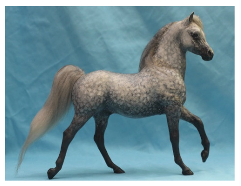
CHAMPION MAJOR REMAKE/RE-PAINT/HAIR OR SCULPTED MANE/ TAIL: IBN HOTEP (SS)