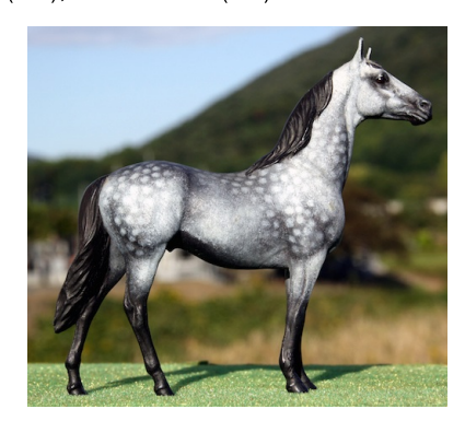
CHAMPION SPORT BREED: ATTN EVILDOERS (AC)

Other Pure or Mixed Sport Breed (5): 1-Tadeusz (AC), 2-Flash of Gold (AC), 3-Legendary (AC), 4-Jack Of Hearts (AC), 5-Flashover (SS)