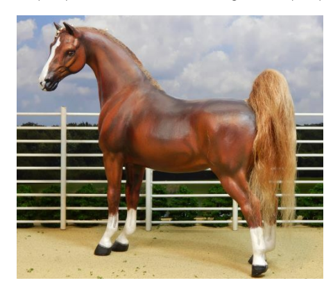
CHAMPION GAITED BREED: LEGENDS OF THE FALL (MH)

Other Pure or Mixed Gaited Breed (11): 1-Sparkling Chablis Z (CM), 2-Foxy Moonshine (CM), 3-Perfection (MH), 4-D.O. National Anthem (MH), 5-Ima Travelin Man (CM), 6-Midnight's Mac (CV), 7-Misty Three-Kay (AC), 8-Glitters Like Gold (JV), 9-Dazzleway (AC), 10-TS Autumn Nor'easter (MP), HM-TS Galilean Dragoness (MP)