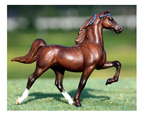
RES. CHAMPION BASE COLOR: STAR-SHIP PHOENIX (AC)

Dapple Grey (16): 1-Wickenden Osprey (AC), 2-Attn Evildoers (AC), 3-Desert Spirit (RB), 4-Ibn Hotep (SS), 5-Silver Bullet (RB),