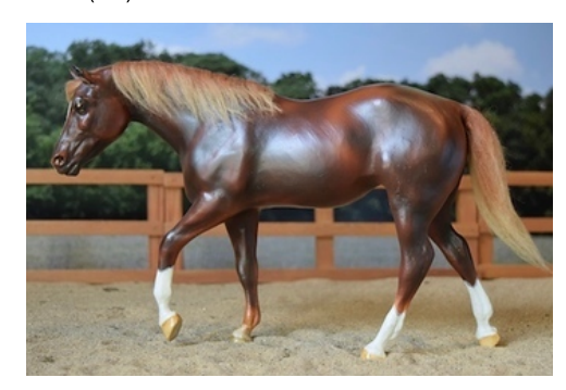
CH. BASE COLOR: WV WILDFIRE (AI)

Black (22): 1-Brigante (AC), 2-TS Elegant Gypsy (MP), 3-Warm Leatherette (AC), 4-Dessaiz (AC), 5-Isaac Godunov (CV), 6-Nyx (AC), 7-Lughz (SS), 8-Athena (AL), 9-RM Saki (CV), 10-Monkey Doodle Doo (CV), HM-PX Le Corbeau (JV)