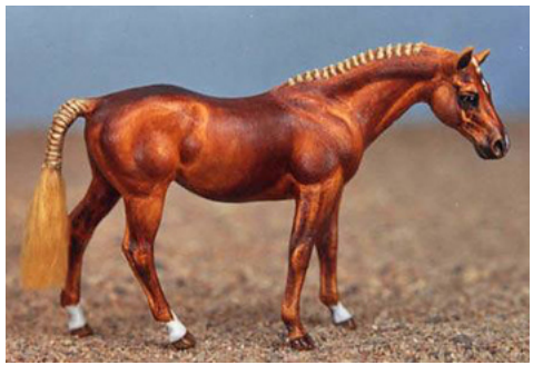
RESERVE CHAMPION SPORT BREED: NATIVE DELICACY (KO)

Paso Fino/Peruvian Paso (9): 1-ME Bolido (MH), 2-Diamond Majestad (CM), 3-Encantador (CM), 4-Danzante (AI), 5-Red Sonia (LeB), 6-Trueno Azul (CM), 7-Tony Harken (AC), 8-Stephano (MH), 9-Reynarda (AC)