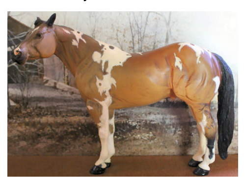
CHAMPION CUSTOM WITH FACTORY PAINT: SERGEANT PEPPER (HC)

Retouch/Partial Paint Removal/Etch on Factory Paint w/Non-Factory Mane/ Tail and Remake and Retouch/Partial Paint Removal/Etch on Factory Paint w/Non-Factory Mane/Tail: none