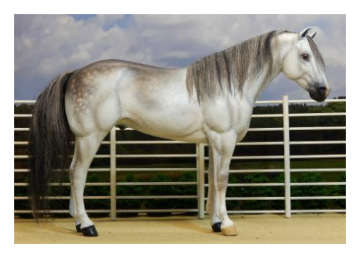
RES. CHAMPION SPANISH BREED: D.O. GUNSMOKE (MH)