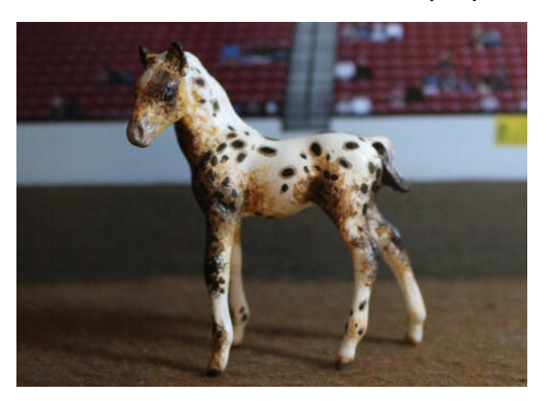
RES. CHAMPION REPAINT: CHARMING CHARLIE (HC)

Repaint w/Hair M/T: Trad. or Larger (41): 1-DA Bardigano Honest John (JV), 2-GS Solitude (MH), 3-RumbleRex (SM), 4-Golden Malicious (SM), 5-PR Nazeem Al-Ashab (JV), 6-Butterfly Kiss (JV), 7-Atragon (AC), 8-Poco Reina (NF), 9-Afternoon Delight (MH), 10-Gateado Mancho (AC), HM-PR Eldorado Spanish Rose (JV)