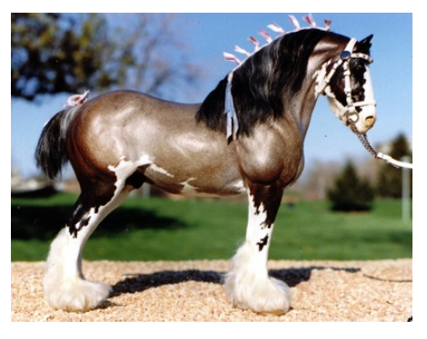
RES. CHAMPION DRAFT BREED: THUNDER IN PARADISE (AC)

American Pony (34): 1-Penny Dreadful (AC), 2-Confederate Gray (LB), 3-Alexander (LeB), 4-Marshall Code (LB), 5-Enchanted Mist (RB), 6-Marty (SS), 7-The Paisley Palette (SR), 8-BBG's Silver Ghost (CM), 9-Empire's Fudge Sundae (CM), 10-Torrent (SR), HM-RP Doctor Sam (AL)