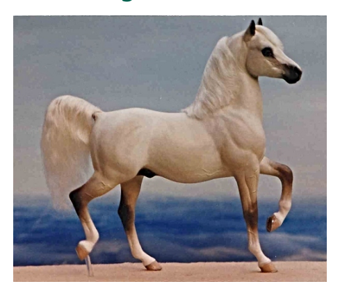
In Emotion (SR)

Stallions (3): 1-White Comet (LeB) [pictured at top of next column] , 2- Ebony & Ivory (CM), 3-Scimitar's Ebony Flame (CM), 4-MCM Lost