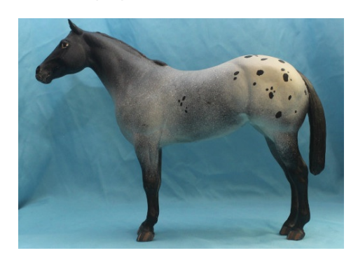
RES. CHAMPION REPAINT: AZURE LADY (SS)

Repaint w/Hair M/T: Trad. or Larger (18): 1-Moment of Chance (MH), 2-Lakota Diamond (EH), 3-Plum Garden (AC), 4-Ahdunit Agin (CV), 5-Dane Tyler Bennington (LB), 6-Lewisfield Latigo (AC), 7-Castle Speckled Shade (CV), 8-Bint Kareyma (SS), 9-Cotton Jenny (MH), 10-Lady Jessica (CV), HM-Sunset's Golden Dream (AC)