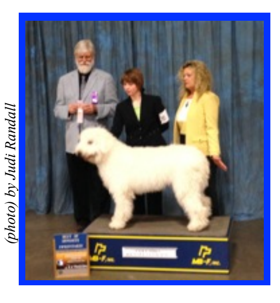
Best Opposite in Sweeps Meadow View Quintessential Victorious (Tori)