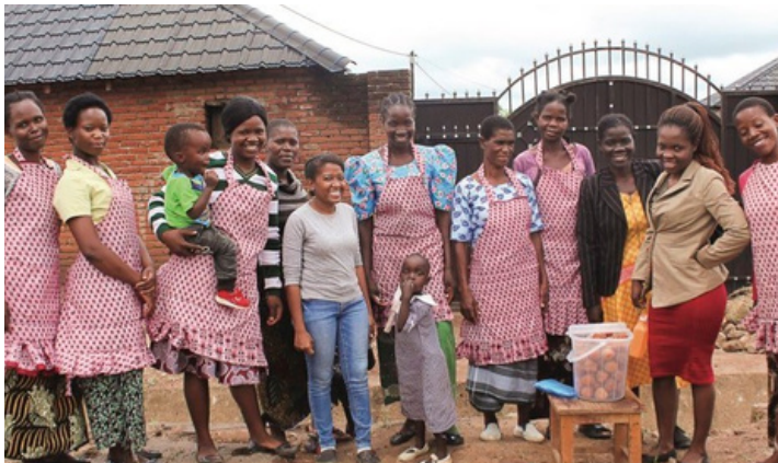
Entrepreneurship trainees visiting their peer's business