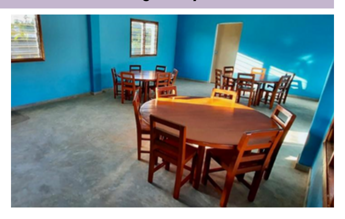
UK Charity Number: 1163114

Whenever needed, we fund the construction, repair and/or fitting out of classrooms and also the replacing of old desks, chairs and cabinets and whiteboards with new ones to ensure the highest standard of education is provided to the children, so they pass their exams and go to college, Breaking The Cycle .