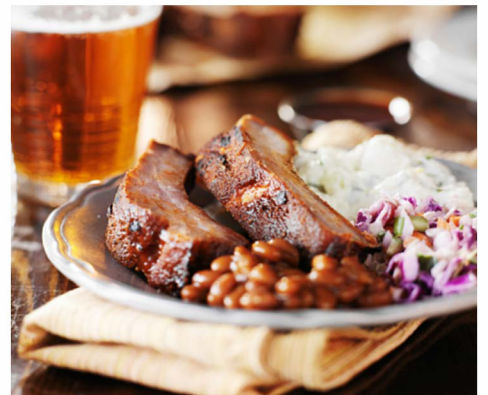
Brews-&-Q's BBQ Trail