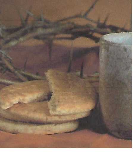
via House to House Heart to Heart

"The cup of blessing which we bless, is it not the communion of the blood of Christ? The bread which we break, is it not the communion of the body of Christ?" 1 CORINTHIANS 10:16