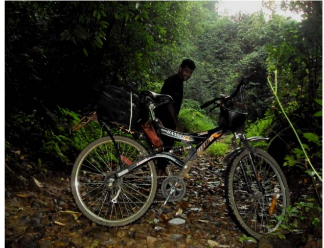
Entry to mundrod forest near kottenchery (kasargod)

This mundrod forest is very strange. Lying in karnataka it can only be approached by a small forest trail through kottenchery.