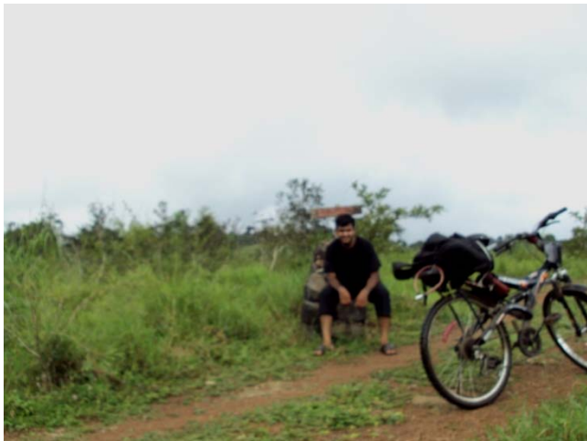
A simple stone wall seperating kerala & karnataka. The board says – Mundrod forest, No trespassing!

This mundrod forest is very strange. Lying in karnataka it can only be approached by a small forest trail through kottenchery.