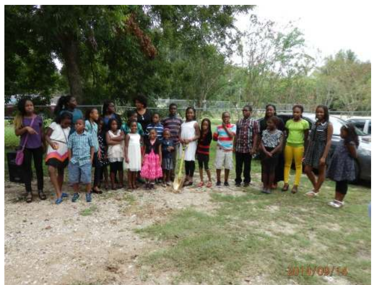
Ground Breaking Ceremony For New Sanctuary