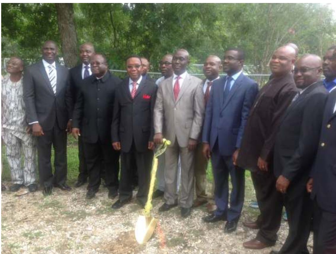
Ground Breaking Ceremony For New Sanctuary