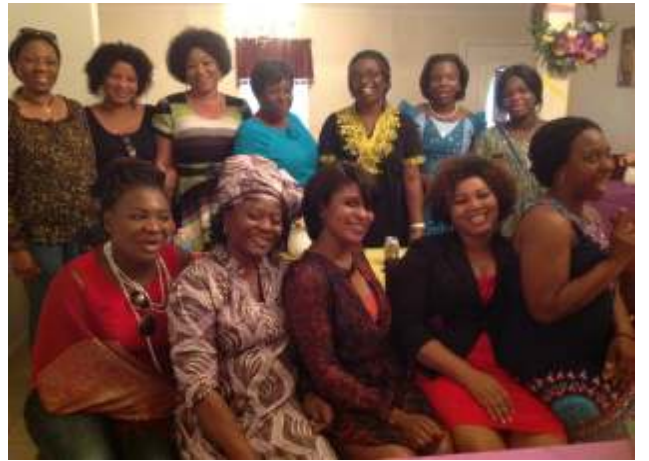
Women of Impact Conference 2014