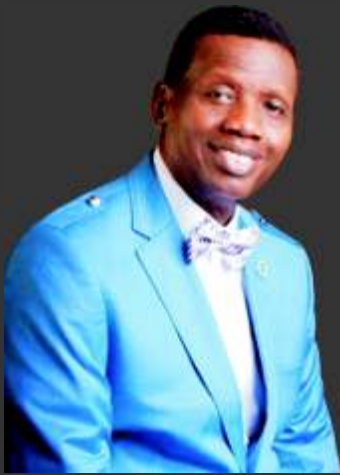
Pastor E. A. Adeboye