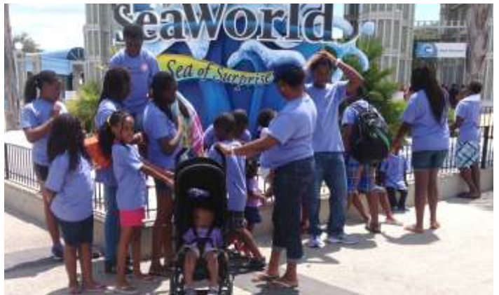
Teens and Children 2014 Summer Camp