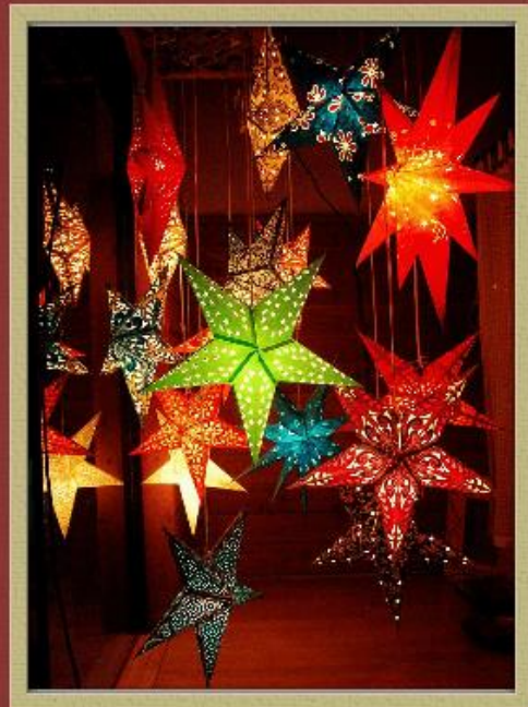
"Christmas Star" Annual Christmas Faire in the Mansion

There is no admission to visit our beautiful mansion where you will discover our club Boutiques, Bake Shoppe, and a ballroom filled with vendors of every description to help you find all of the gifts and goodies you need for the holiday season.