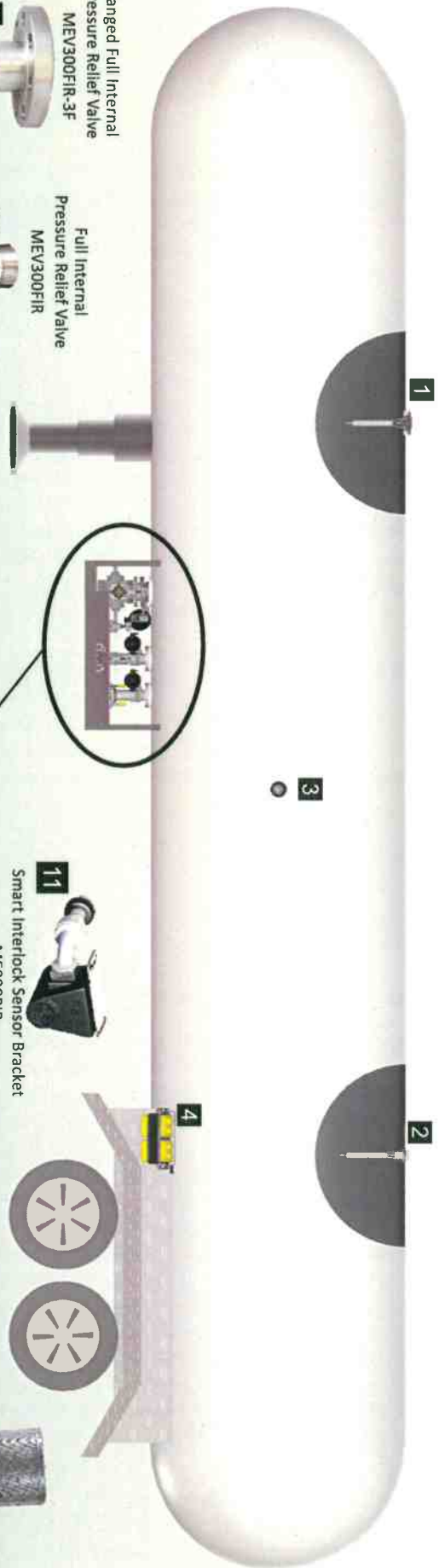
1 Flanged Full Internal Pressure Relief Valve MEV300FIR-3F