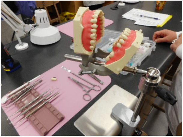
Ready to work on temp crowns, bridges and veneers