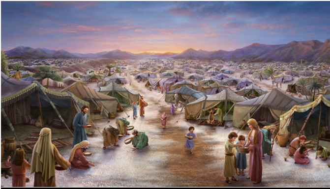
By: The Word Among Us