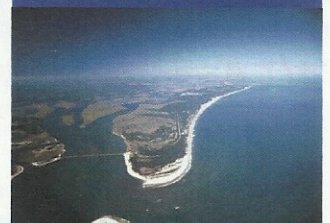
Aerial view of Amelia Island