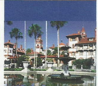
St. Augustine, our Nation's Oldest City

Bringing Group Travel to a Higher Standard®