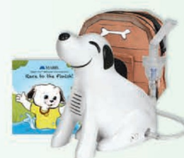
Digger Dog® Pediatric Nebulizer Kit