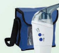
MiniBreeze™ Ultrasonic Nebulizer