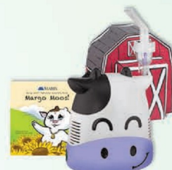
Margo Moo® Pediatric Nebulizer Kit