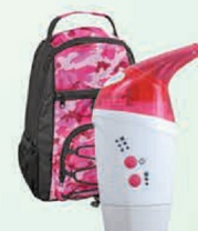
NebPak® "Tween" Nebulizer Kit, Camouflage Pink