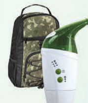
NebPak® "Tween" Nebulizer Kit, Camouflage Green