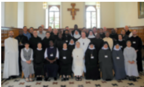
Participants at the Leadership Course in Rome