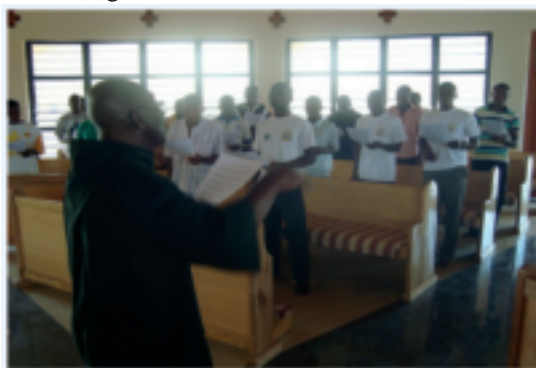
small house in the vicinity of the Monastery) and (Right) rehearsing some of the Tamale seminarians.

Although I do not consider myself a theologian in any form or fashion, it was a stretching experience, and, in retrospect, I was happy to have been given the opportunity to document the impact of Vatican Council II on the Abbey. The abstract, quoted below, gives the gist of my presentation: