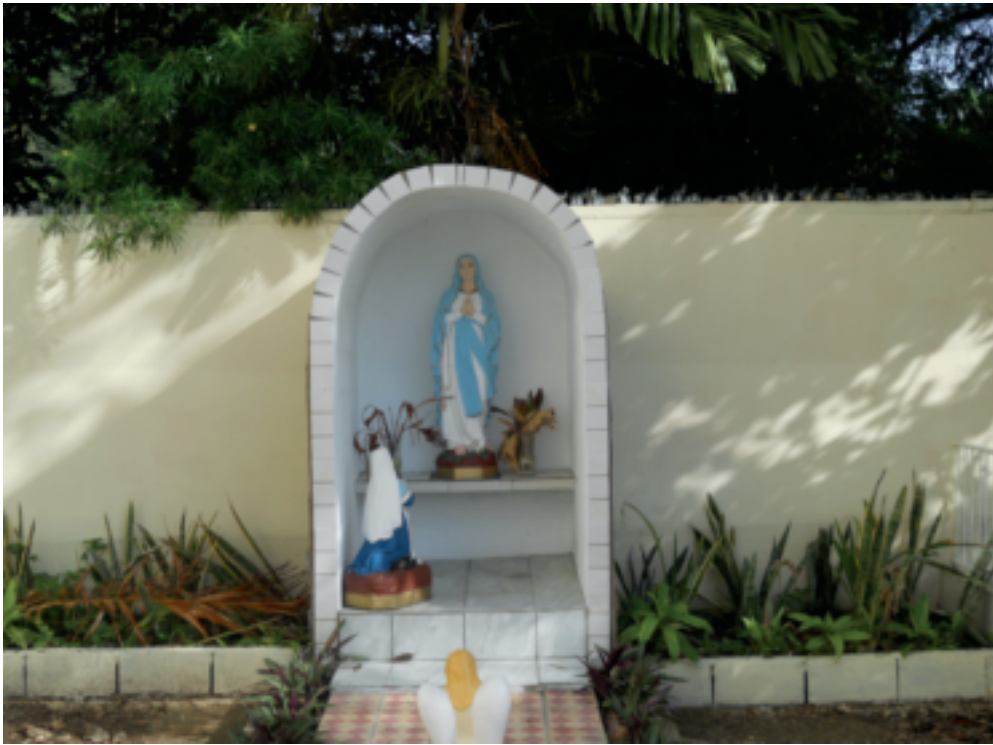
Statues of Our Lady and St Bernadette (see article on page 3)