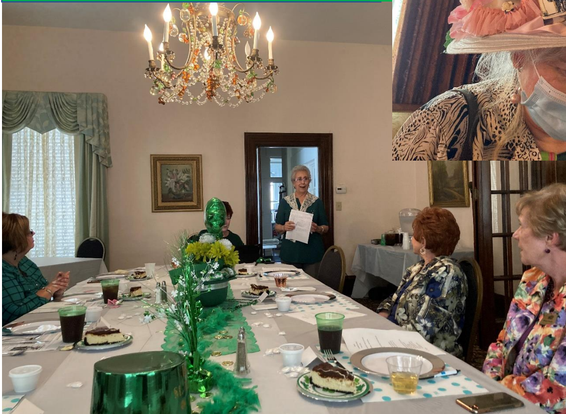
Pictured to the left are members of the Friendship Round Table enjoying being together again in the main dining room.