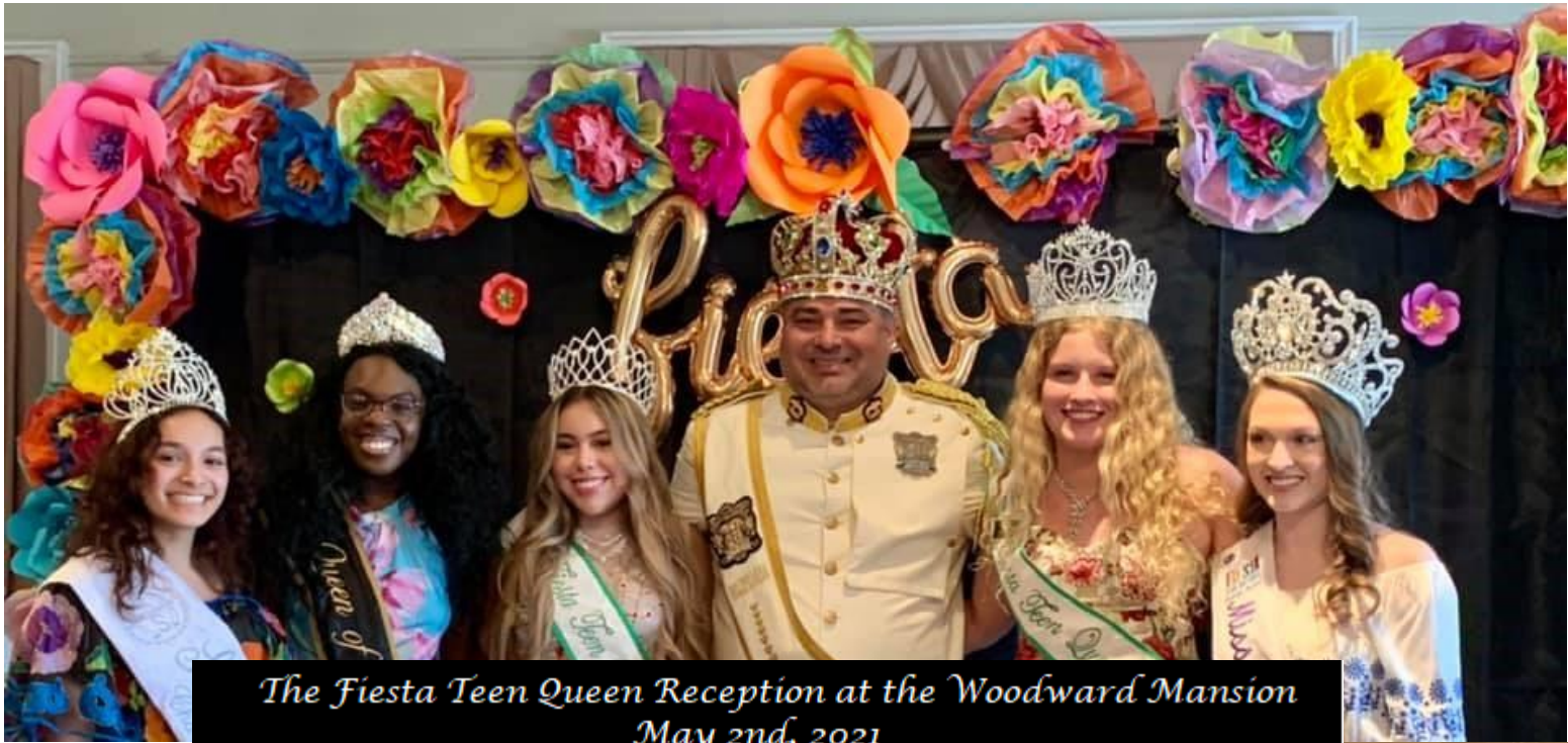
The Fiesta Teen Queen Reception at the Woodward Mansion May 2nd, 2021