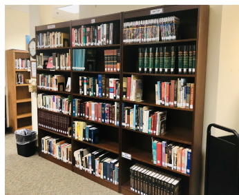
Biography and Commentaries