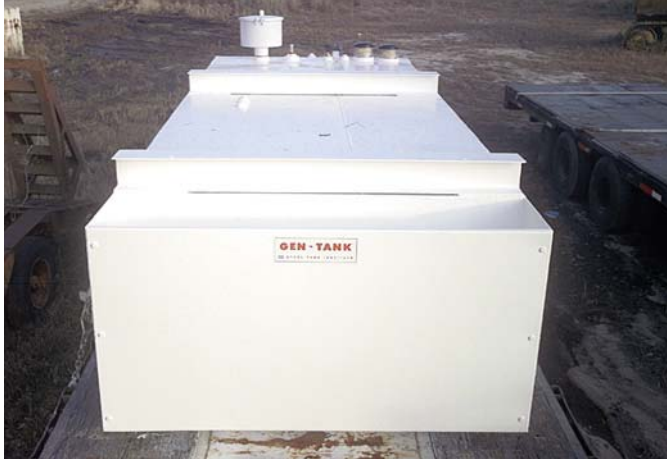
Low profile design enables structural support for the generator mounting

GEN-TANK Generator Base Tank provides sturdy support for your backup or emergency power generator. The low profile of the GEN-TANK design serves as the structural support for the generator mounting, while providing storage for a complete supply of generator diesel fuel.