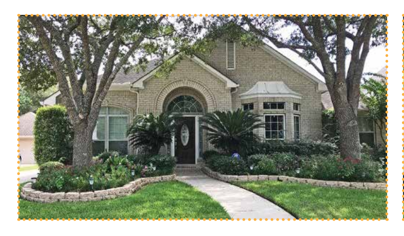
8619 Concerto Circle