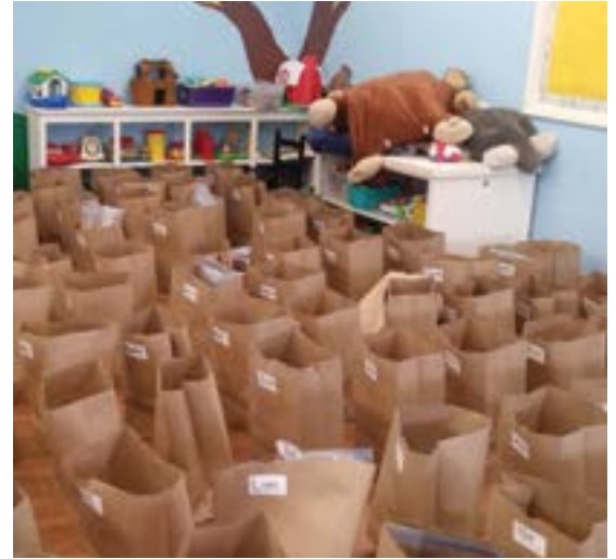
Trinity Christian School has their first-ever homework drop-off and pick-up event