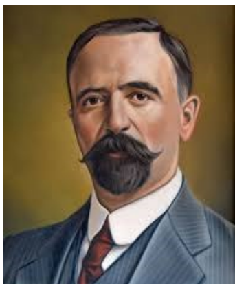
Francisco I. Madero