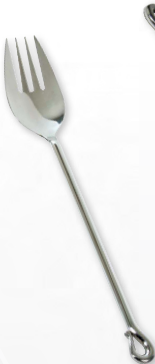
CAL412 Chafing Dish Fork "Spork" Style 13"L 0.4 lb. ea. $24 List ea.