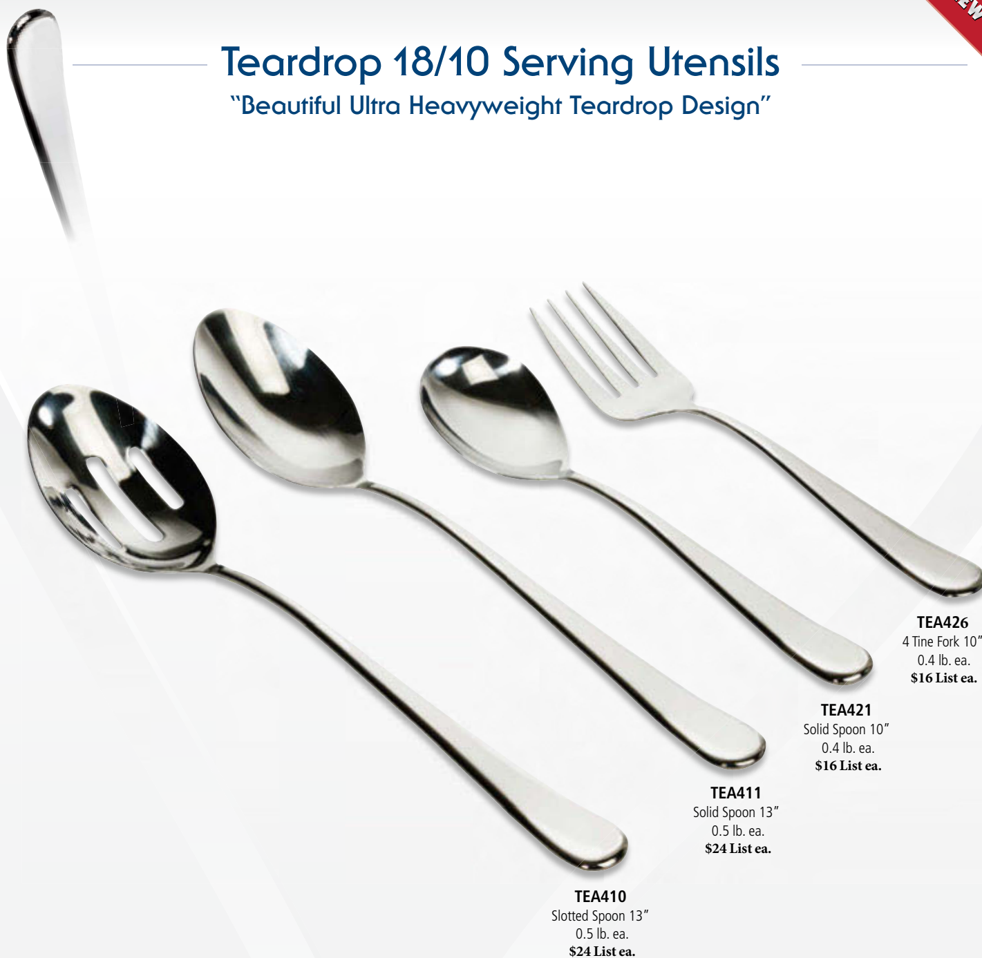
TEA426 4 Tine Fork 10" 0.4 lb. ea. $16 List ea.

"Beautiful Ultra Heavyweight Teardrop Design"