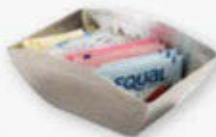
NWVCSP Stackable Sugar Pack Holder / Candy Dish 4.5"L x 3.5"W x 2" 0.25 lb. ea. Also available Shiny - MECSP $16 List ea.