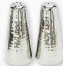
CHASP9 Conical Salt / Pepper Set 3.75" H 0.4# set $42 List set