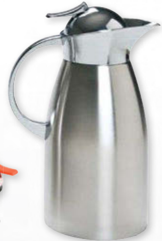
LCP1500 Lux Vacuum Insulated Server Push Button Pour Removable Lid 1.5 Liter / 51 oz. 5.25" Dia. x 10" H 2.4 lb. ea. $75 List ea.