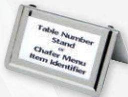
NWVTC 2-Sided Table Card / Food ID Holder Accepts 3.5"W x 2"H Cards 4.25"W x 2.75"H 0.35 lb. ea. $15 List ea.