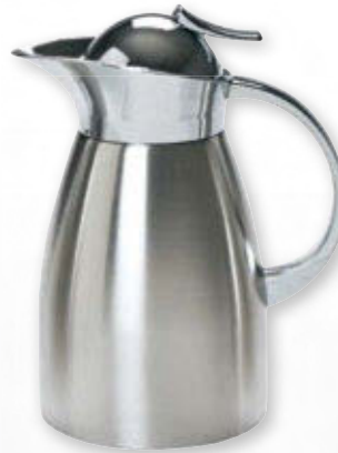
LCP1000 Lux Vacuum Insulated Server Push Button Pour Removable Lid 1.0 Liter / 34 oz. 5.25" Dia. x 8.5" H 2.2 lb. ea. $65 List ea.