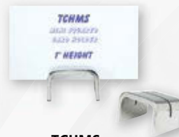
TCHMS Mini Squared Table Card / Food ID Holder 1.5"W x 1"H 0.1 lb. ea. $6 List ea.