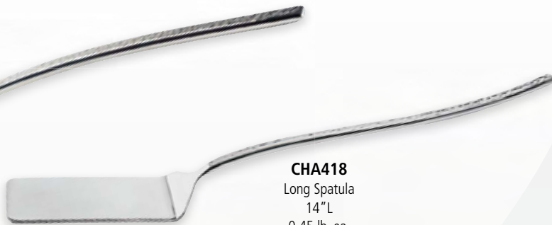
CHA418 Long Spatula 14" L 0.45 lb. ea. $24 List ea.