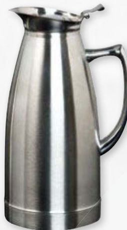
CWP1000B Classic Vacuum Insulated Server Flip Hinged Lid 1.0 Liter / 34 oz. 4" Dia. x 9" H 1.8 lb. ea. $65 List ea.