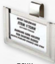
TCHH Hanging Chafing Dish Food ID Holder 4.25"W x 3"H 0.25 lb. ea. $20 List ea.