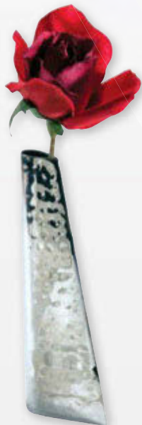
CHABV Bud Vase 7" H 0.5 lb. ea. $26 List ea.