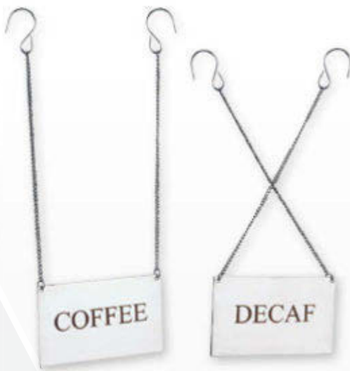
TCHCD Reversible COFFEE/DECAF Chain ID 4.25"W x 2.75"H 0.25 lb. ea. $20 List ea.