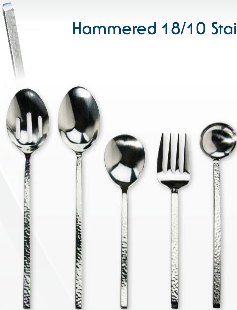
CHA410 Chafing Dish Spoon Slotted 13" L 0.3 lbs. ea. $24 List ea.