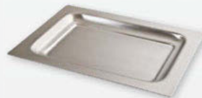
NWVTT Cash Tray / Underliner 6"W x 8"L 0.5 lb. ea. $26 List ea.