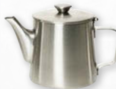
ETP12GB Teapot w/Gooseneck Pour 12 oz. / 0.35 Liter 3.25" Dia. x 3.75"H 1.0 lb. ea. $61 List ea.