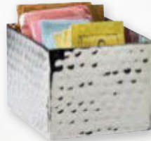
CHASBX Sugar Box 3" L x 2.5" W x 2" H 0.5 lb. ea. $16 List ea.