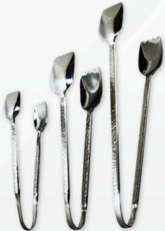
CHA404 Small Tongs 7" L 0.3 lbs. ea. $16 List ea.

All Myco Tableware 18/10 Utensils carry a 1 Year Guarantee Against Rusting