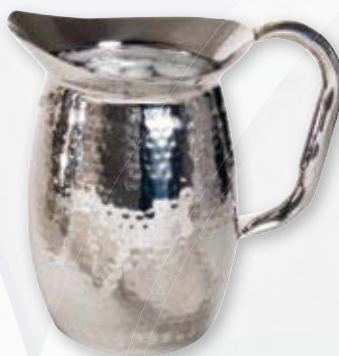
CHBP180 Standard Bell 68 oz. / 2.0 Liter without guard 5.25" Diameter x 8"H 1.2 lb. ea. Our Most Economical! $56 List ea.