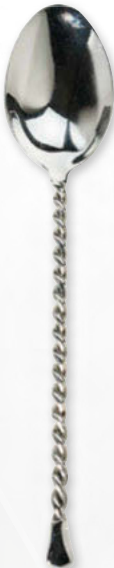
MIR411 Chafing Dish Spoon Solid 13" L 0.3 lbs. ea. $24 List ea.