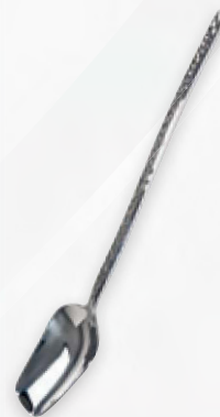
CHA416 Salad Topping / Sprinkle Spoon 8" L 0.15 lb. ea. $8 List ea.