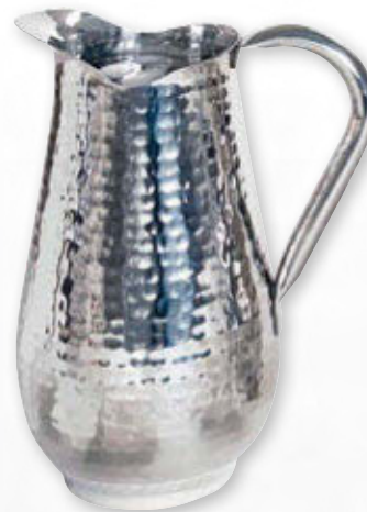
CHM025 Dolphin 85 oz. / 2.5 Liter without guard 5" Diameter x 10"H 1.2 lb. ea. Upscale Look! $66 List ea.