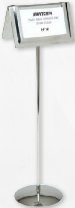
NWVTCH14 2 sided Holder with Stand Accepts 3.5"W x 2"H Cards 4.25"W x 14" H 1.0 lb. ea. $30 List set