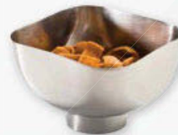
NWVBWL Footed Snack Bowl 4.5"W x 3"H / 15 oz. 0.5 lb. ea. Also available Shiny - MEBWL $26 List ea.