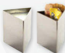
NWVTCR Triangle Creamer/ Sugar Tube Holder 4 oz. / 0.12 liter 2.5"W x 3"H 0.3 lb. ea. Also available Shiny - METCR $20 List ea.