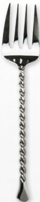
MIR426 Serving Fork 4 prong 10" L 0.25 lbs. ea. $16 List ea.