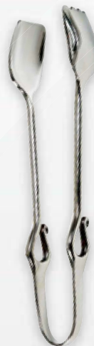
CAL404 Small Tongs 7" L 0.3 lbs. ea. $16 List ea.

List Prices for Reference only - Contact your Foodservice Distributor for Discounted Costs