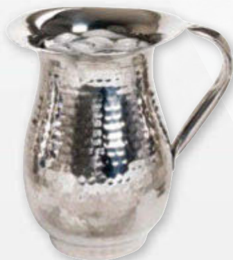
CHBP200 Footed Bell 68 oz. / 2.0 Liter without guard 6" Diameter x 8.25"H 1.3 lb. ea. Our Most Popular! $61 List ea.