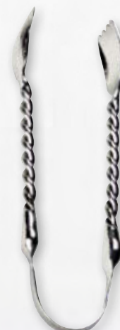
MIR404 Small Tongs 7" L 0.3 lbs. ea. $16 List ea.

List Prices for Reference only - Contact your Foodservice Distributor for Discounted Costs