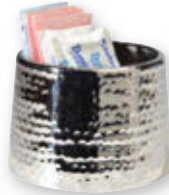
CHASB Sugar Bowl w/o cover 3" Diameter x 2"H 0.25 lb. ea. $26 List ea.