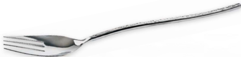
CHA412 Chafing Dish Fork "Spork" Style 13" L 0.5 lb. ea. $24 List ea.