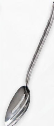
CHA432 Family Style Spoon Slotted 8.5" L 0.25 lb. ea. $12 List ea.