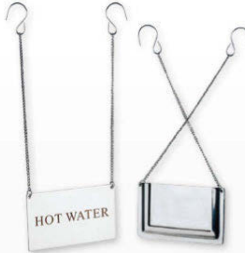
TCHPH Reversible Hot Water/Plain Slotted Chain ID 4.25"W x 2.75"H 0.25 lb. ea. $20 List ea.