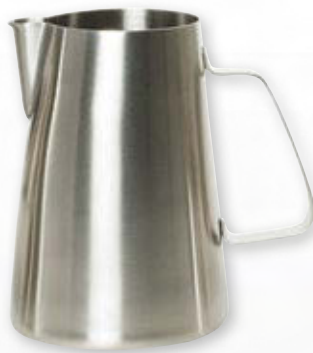
NWVWP68 Water Pitcher w/o guard 68 oz. / 2.0 Liter 5.5" Dia. x 7.75"H 1.5 lb. ea. $100 List ea.