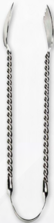
MIR415 Serving Tongs 12" L 0.45 lbs. ea. $26 List ea.