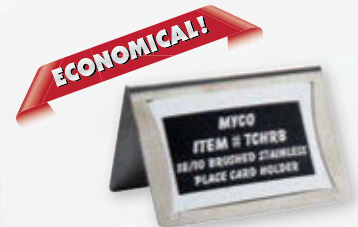
TCHRB 1-Sided Table Card / Food ID Holder 4"W x 2.75"H 0.2 lb. ea. $6 List ea.