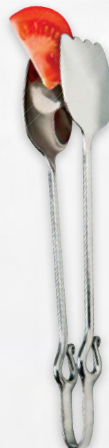
CAL414 Salad Tongs 9.5" L 0.35 lbs. ea. $24 List ea.