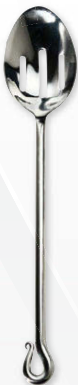
CAL410 Chafing Dish Spoon Slotted 13" L 0.3 lbs. ea. $24 List ea.