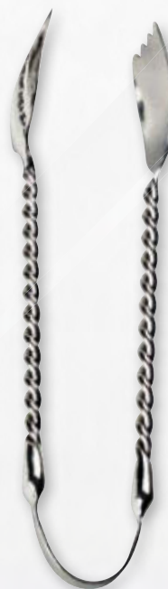
MIR414 Salad Tongs 9.5" L 0.35 lbs. ea. $24 List ea.