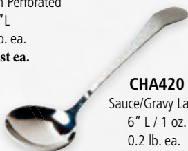
CHA420 Sauce/Gravy Ladle 6" L / 1 oz. 0.2 lb. ea. $8 List ea.