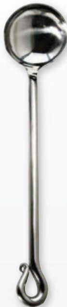
CAL419 Salad Dressing Crock Ladle 11" L / 1 oz. 0.25 lbs. ea. $16 List ea.