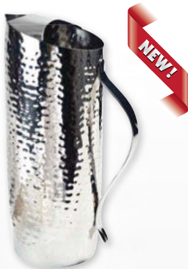
CHAWPG Moderne 68 oz. / 2.0 Liter with Ice Guard 4.5" Diameter x 11"H 1.2 lb. ea. Perfect for Meeting Rooms! $80 List ea.