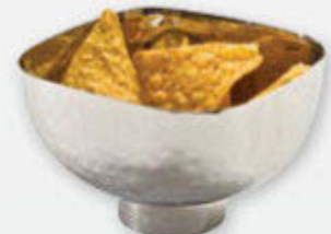
CHABWL Footed Chip / Salsa Bowl 4.5" L x 4.5" W x 3" H / 15 oz. 0.5 lb. ea. $26 List ea.