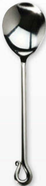
CAL421 Serving Spoon Solid 10" L 0.25 lbs. ea. $16 List ea.