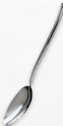
CHA431 Family Style Spoon Solid 8.5" L 0.25 lb. ea. $12 List ea.