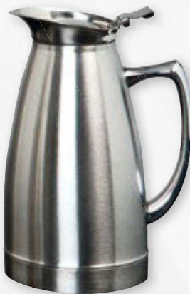
CWP700B Classic Vacuum Insulated Server Flip Hinged Lid 0.7 Liter / 22 oz. 4" Dia. x 8" H 1.7 lb. ea. $55 List ea.