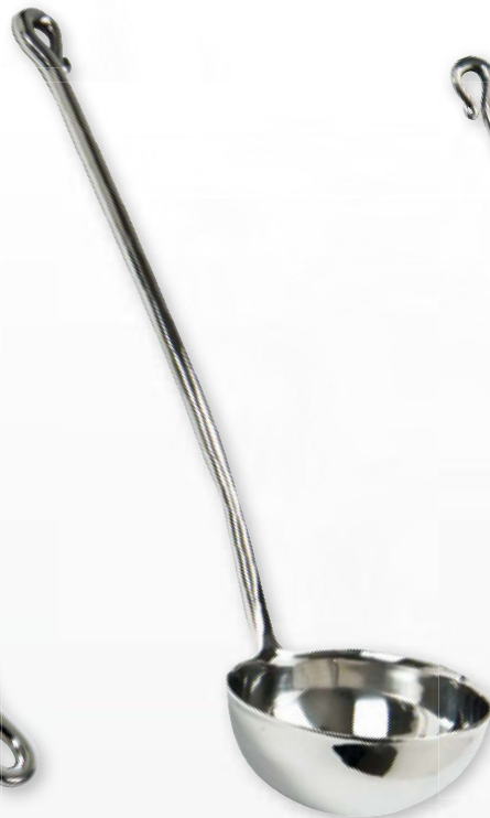
CAL423 Punch Ladle 15"L / 6 oz. 0.75 lb. ea. $30 List ea.