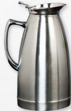
CWP1500B Classic Vacuum Insulated Server Flip Hinged Lid 1.5 Liter / 51 oz. 5" Dia. x 10" H 2.2 lb. ea. $75 List ea.