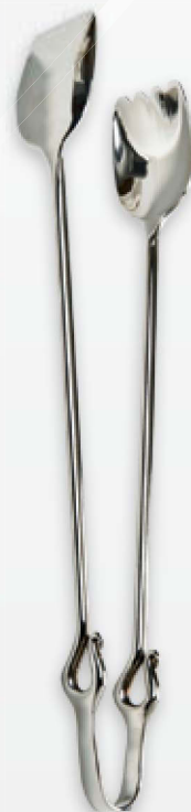
CAL415 Serving Tongs 12" L 0.45 lbs. ea. $26 List ea.