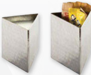
CHATCR Triangle Creamer / Sugar Tube Holder 4 oz. / 0.12 liter 2.5" W x 3" H 0.3 lb. ea. $20 List ea.