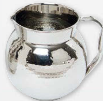
CHBP235 Ball Style 80 oz. / 2.4 Liter without guard 8" Diameter x 7.75"H 1.7 lb. ea. Economical & Unique! $56 List ea.

List Prices for Reference only - Contact your Foodservice Distributor for Discounted Costs