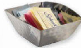
CHACSP/CHM027 Curved Sugar Pack Holder / Candy Dish 4.5" L x 3.5" W x 2" H 0.25 lb. ea. $16 List ea.