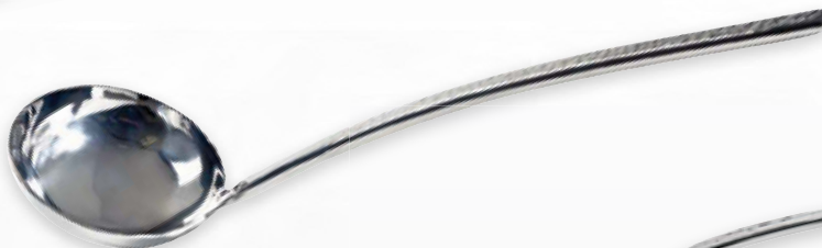
CHA413 Punch/Soup Ladle 13" L / 3 oz. 0.5 lb. ea. $24 List ea.