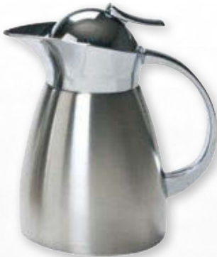
LCP67 Lux Vacuum Insulated Server Push Button Pour Removable Lid 0.6 Liter / 20 oz. 5.25" Dia. x 7.25" H 2.1 lb. ea. $55 List ea.