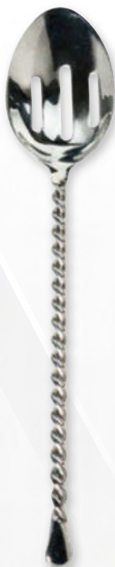
MIR410 Chafing Dish Spoon Slotted 13" L 0.3 lbs. ea. $24 List ea.