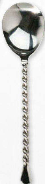
MIR421 Serving Spoon Solid 10" L 0.25 lbs. ea. $16 List ea.