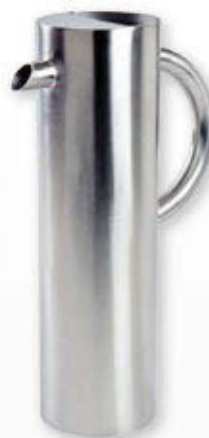
MCWP60B "Zen" Water Pitcher w/ Guard 60 oz. / 1.8 liter 4" Dia. x 11.5"H 2.0 lb. ea. $95 List ea.