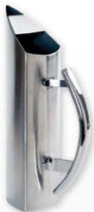
NWWWPG Triangular Water Pitcher w/ Guard 48 oz. / 1.4 liter 4"W x 13"H 2.5 lb. ea. $90 List ea.