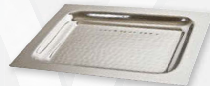
CHATT Cash Tray / Underliner 6" W x 8" L 0.5 lb. ea. $26 List ea.