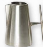
NWVCR120 Creamer w/o cover 4.5 oz. / 0.13 Liter 3.5" Dia. x 3.5"H 0.3 lb. ea. $26 List ea.