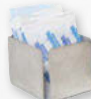
NWVSPS Sugar Pack Holder Mini 2.1"L x 1.5"W x 1.5"H 0.15 lb. ea. $15 List ea.