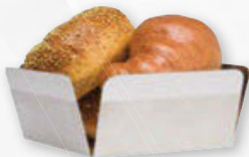
NWVSBB Roll Basket 6"W x 2.5"H 0.5 lb. ea. $26 List ea.