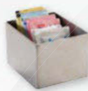
NWVSBX Sugar Box 3"L x 2.5"W x 2"H 0.5 lb. ea. Also available Shiny - MESBX $16 List ea.