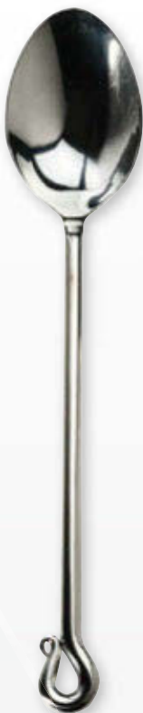
CAL411 Chafing Dish Spoon Solid 13" L 0.3 lbs. ea. $24 List ea.