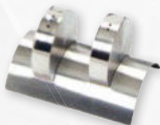
NWVDSP Disc Salt / Pepper Set with Tray 3" Dia. x 4.5"H 0.75 lb. set $40 List set