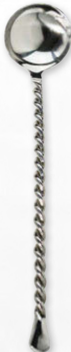
MIR419 Salad Dressing Crock Ladle 11" L / 1 oz. 0.25 lbs. ea. $16 List ea.