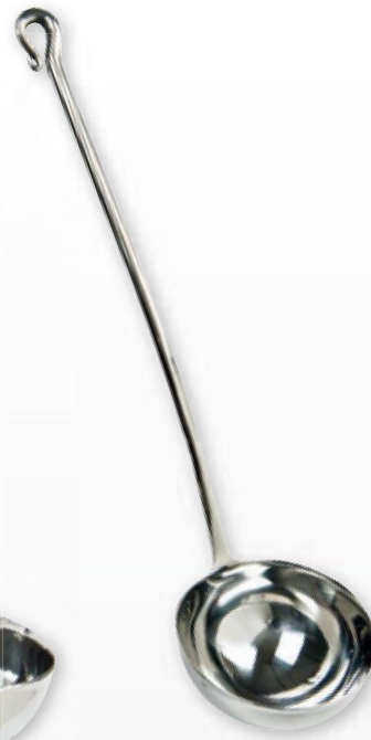
CAL413 Soup Ladle 13"L / 3 oz. 0.5 lb. ea. $26 List ea.