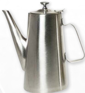
NWVCPG Coffee Pot w/Gooseneck Pour 68 oz. / 2.0 Liter 4.5" Dia. x 10"H 1.5 lb. ea. $90 List ea.