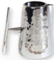
CHACR120 Creamer w/o cover 4.5 oz. / 0.13 liter 3.5" Diameter x 3.5"H 0.3 lb. ea. $26 List ea.