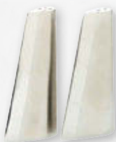
NWVTSP Triangular Salt / Pepper Set 3.75"H 0.4 lb. set $40 List set