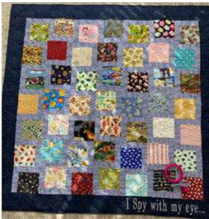
"I SPY 1" Free Pattern