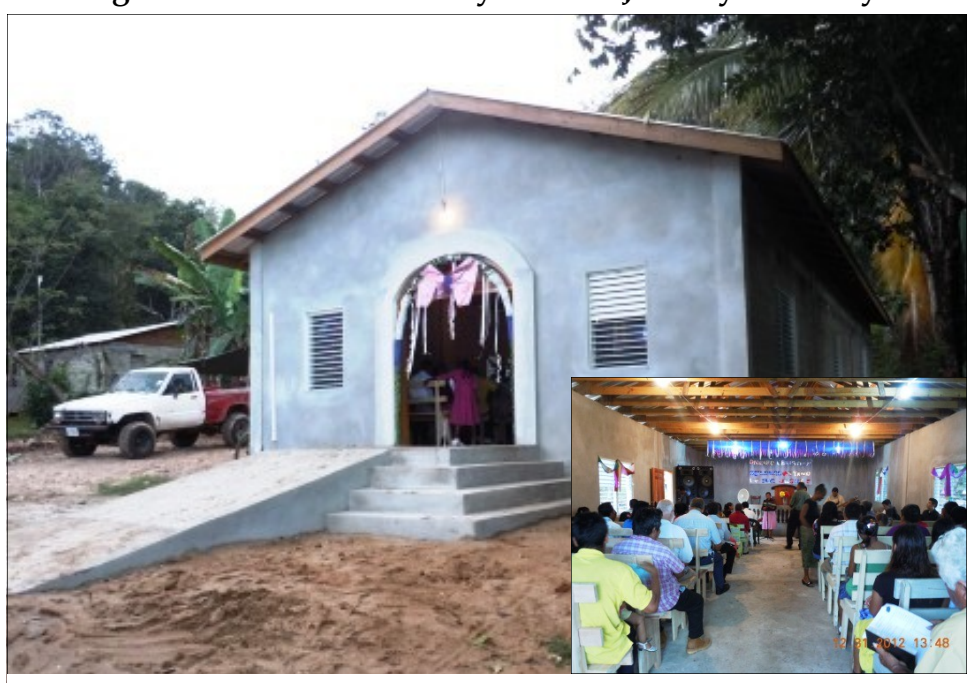
Thank you Sunnyside Church, Portland, OR! Story pg 3