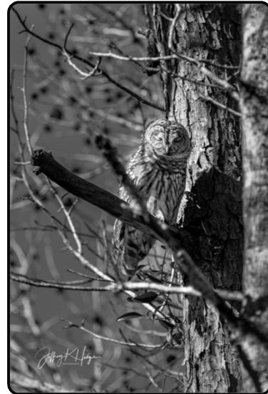
Barred Owl 1/500 sec, f/7.1, ISO 400, 400 mm Spring Creek Nature Trail