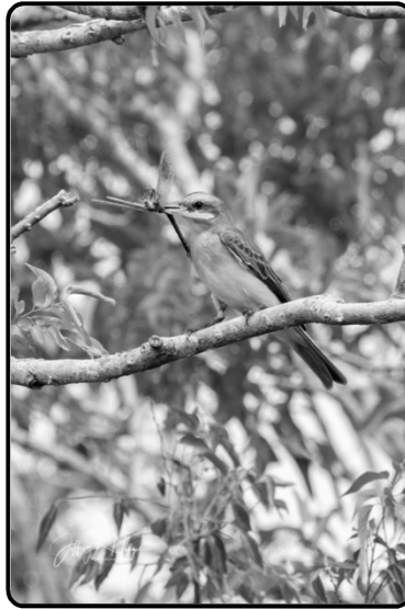
Tropical King Bird 1/640 sec, f/7.1, ISO 400, 400 mm Southern Texas