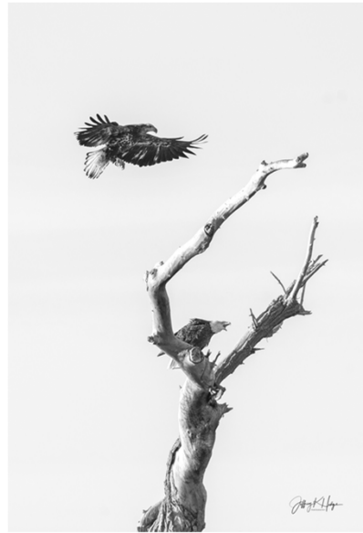
Bald Eagles at Bosque Del Apache 1/1250 sec, f/7.1, ISO 640, 800 mm