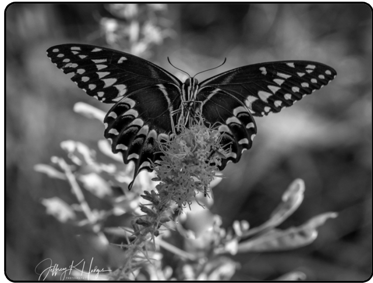
Swallow Tail Butterfly 1/125 sec, f/10, ISO 400, 400 mm