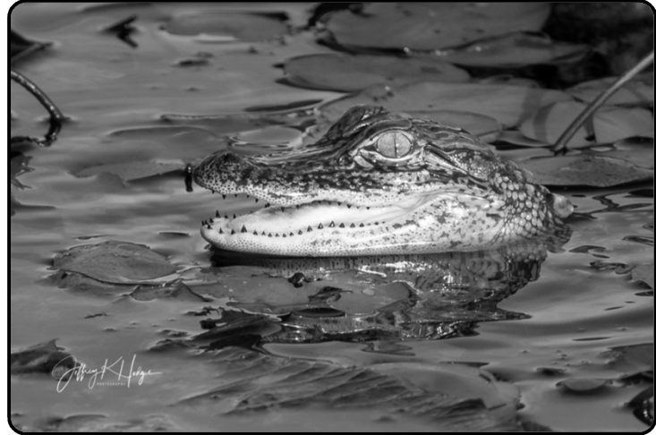
Baby Alligator 1/1000 sec, f/8.0, ISO 800, 800 mm Attwater Prairie Chicken National Wildlife Refuge