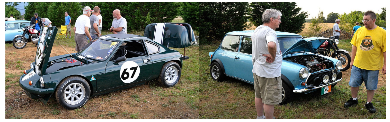
(above) Lou Casazza's '67 Ginetta G-15 racer