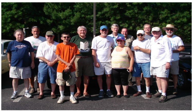
(above) Tour of South Jersey 2016 (below) MG 2016 Louisville, KY