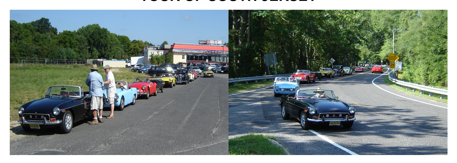
(above) The start of the 2016 Tour of SJ