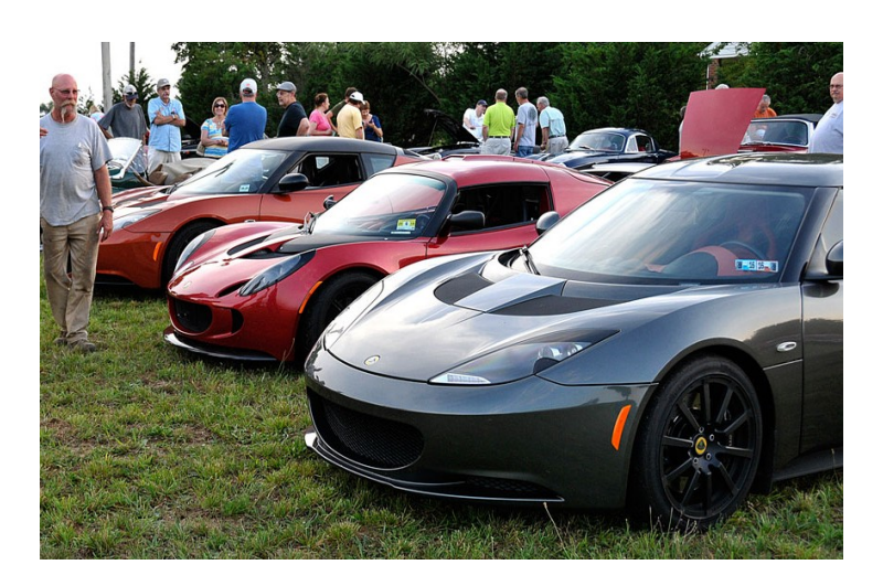
(above) 3 very new Lotus's made an appearance