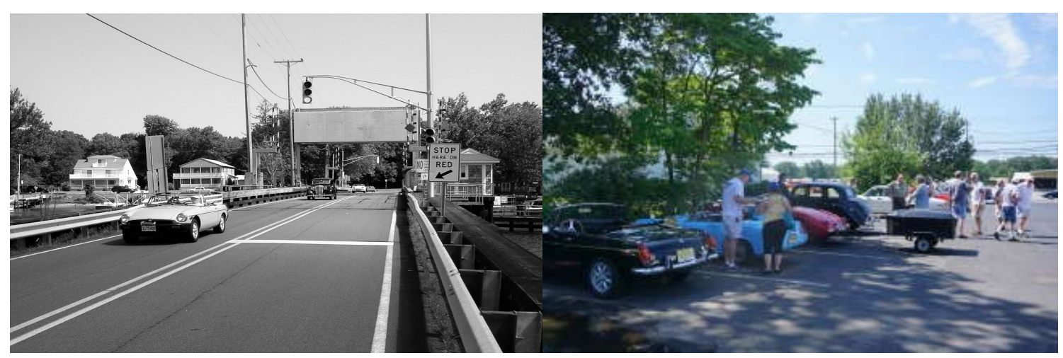
(above) Tour crossing Green Bank Draw Bridge