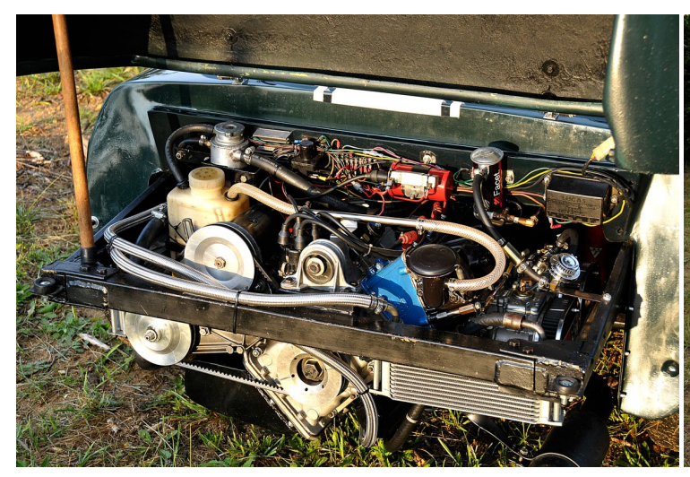
Lou Casazza's '67 Ginetta G-15 racer powered by an Hillman Imp engine. Car weight: 1,450 lbs. Engine disp.: 1,040cc Engine output: 112 Hp.