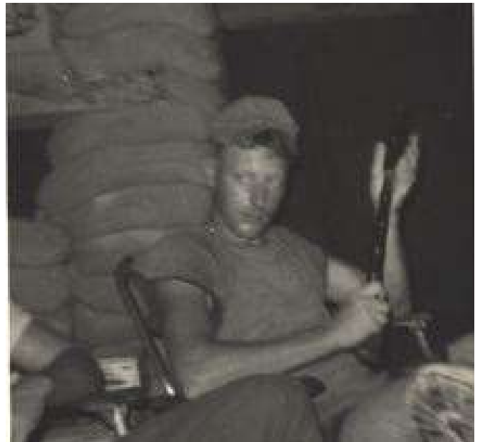
Do you know this Detachment member, former Detachment Commandant?