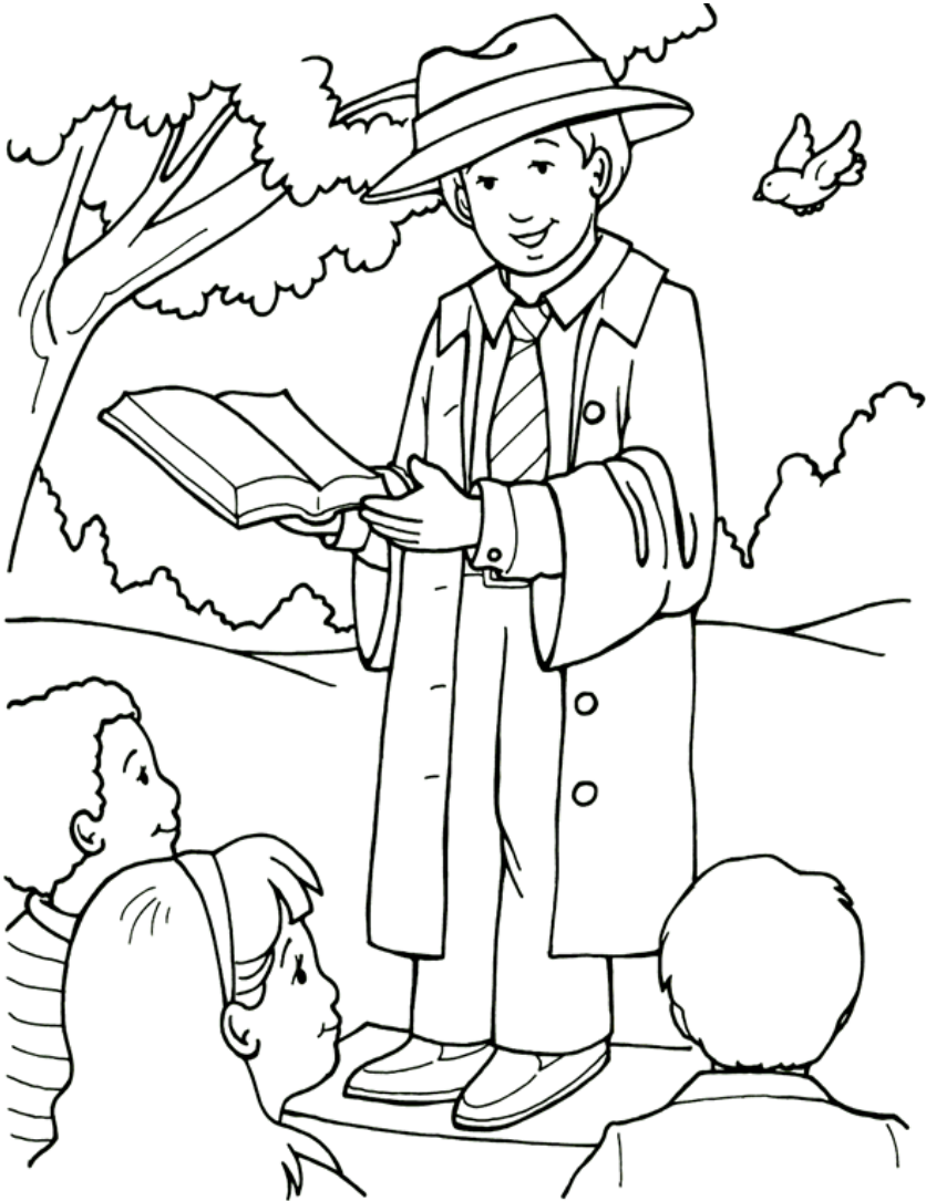
Inviting others to Jesus.

From Thru-the-Bible Coloring Pages for Ages 4-8. © 1986,1988 Standard Publishing. Used by permission. Reproducible Coloring Books may be purchased from Standard Publishing, www.standardpub.com, 1-800-543-1301.