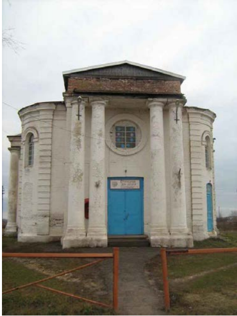
Church in Reinwald, Russia, home to many of Sheboygan's German Russian families.