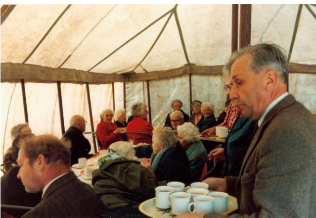
Tea-party for the old folk