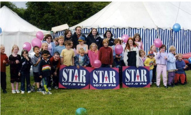
Star Bug Radio