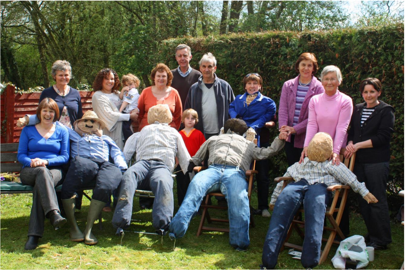
Scarecrow making workshop at Brookside