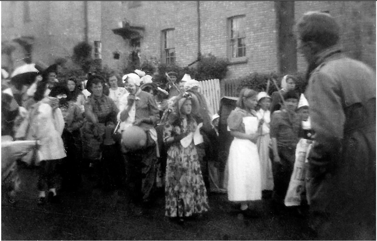
Toft Coronation parade