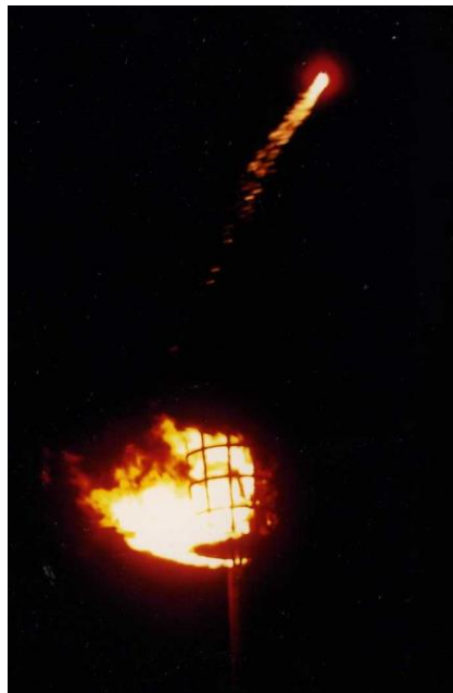
The Toft beacon lit, and rocket