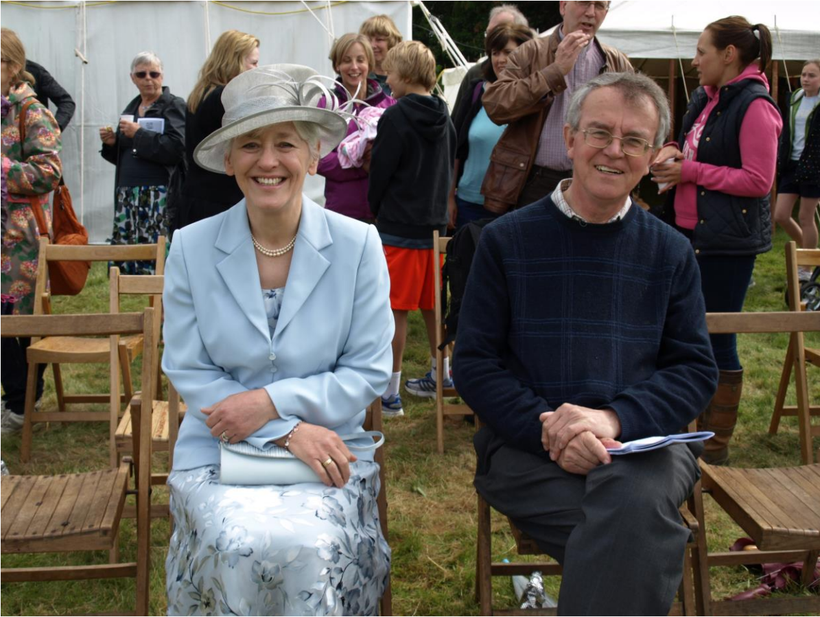
“The Queen” attends the Sports Day