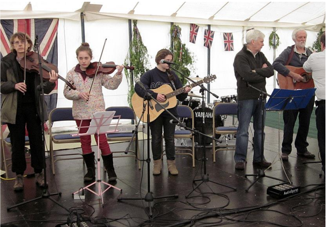
Toft Session musicians at the Variety Show