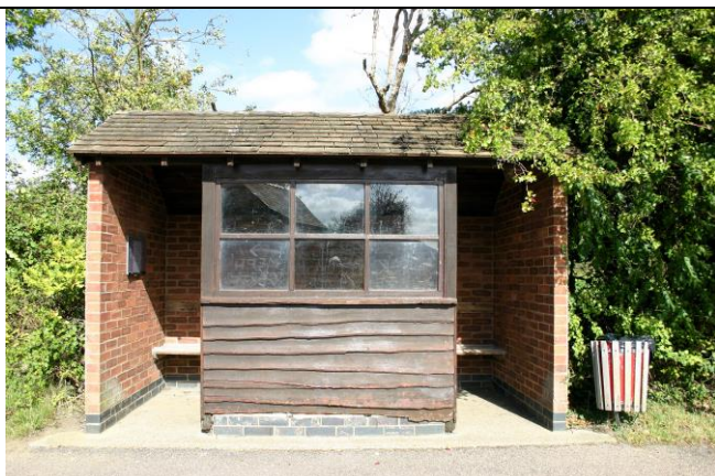
Toft bus shelter & commemorative plaque