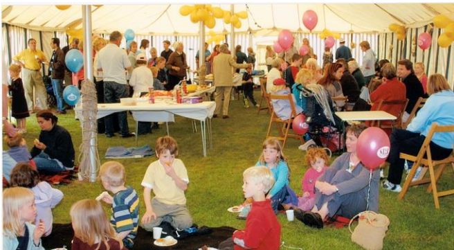
Children's event in the marquee

I would like to add a picture of the jubilee pennant if possible – picture 1 of email on 24/11