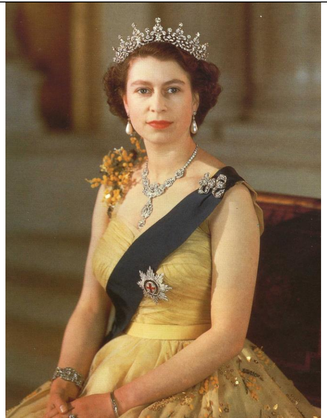
HM Queen Elizabeth II