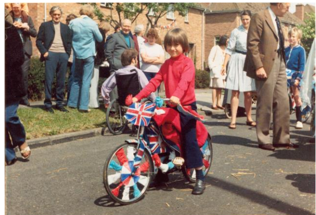
Decorated Bile competition