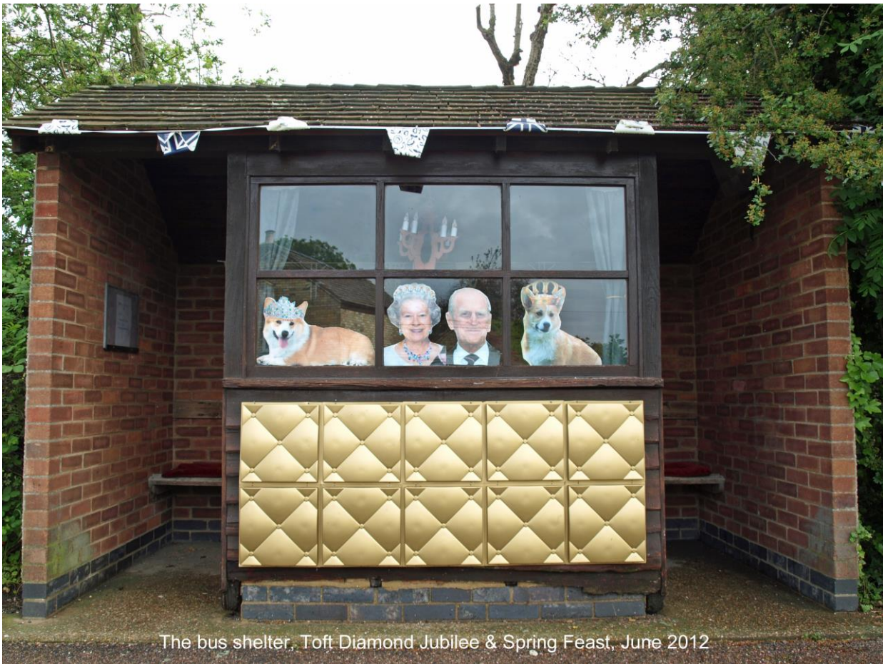
The bus shelter, Toft Diamond Jubilee & Spring Feast, June 2012