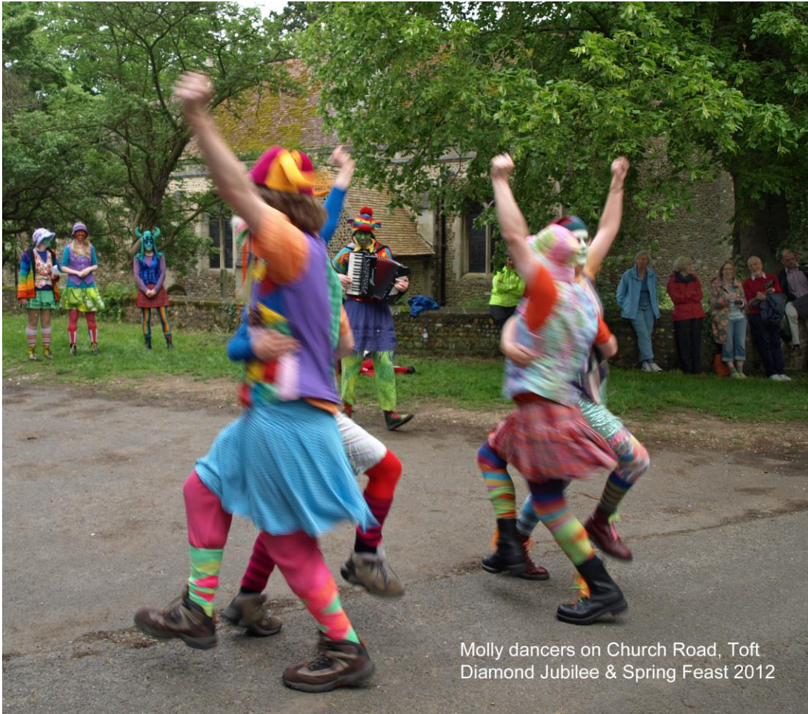
Molly dancers on Church Road, Toft Diamond Jubilee & Spring Feast 2012