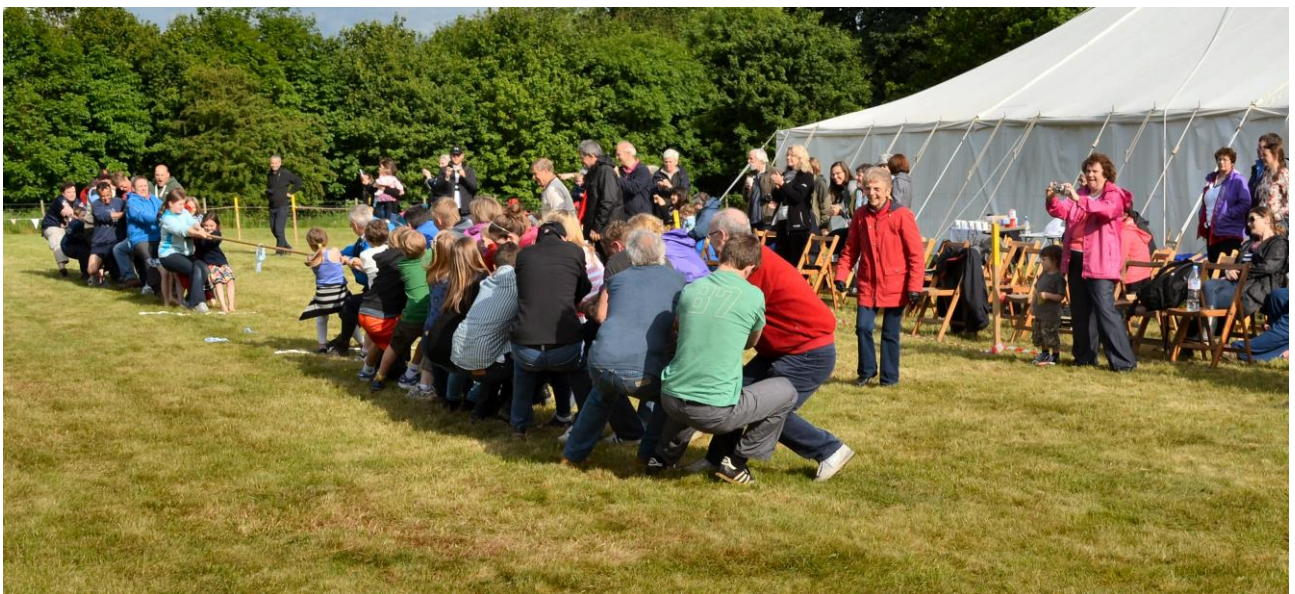
Tug-o-war at the Sports Day