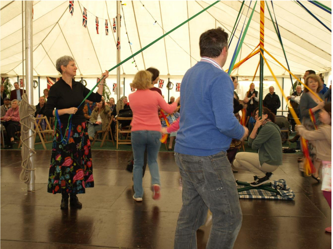
Maypole dancing in the marquee (bad weather outside!)