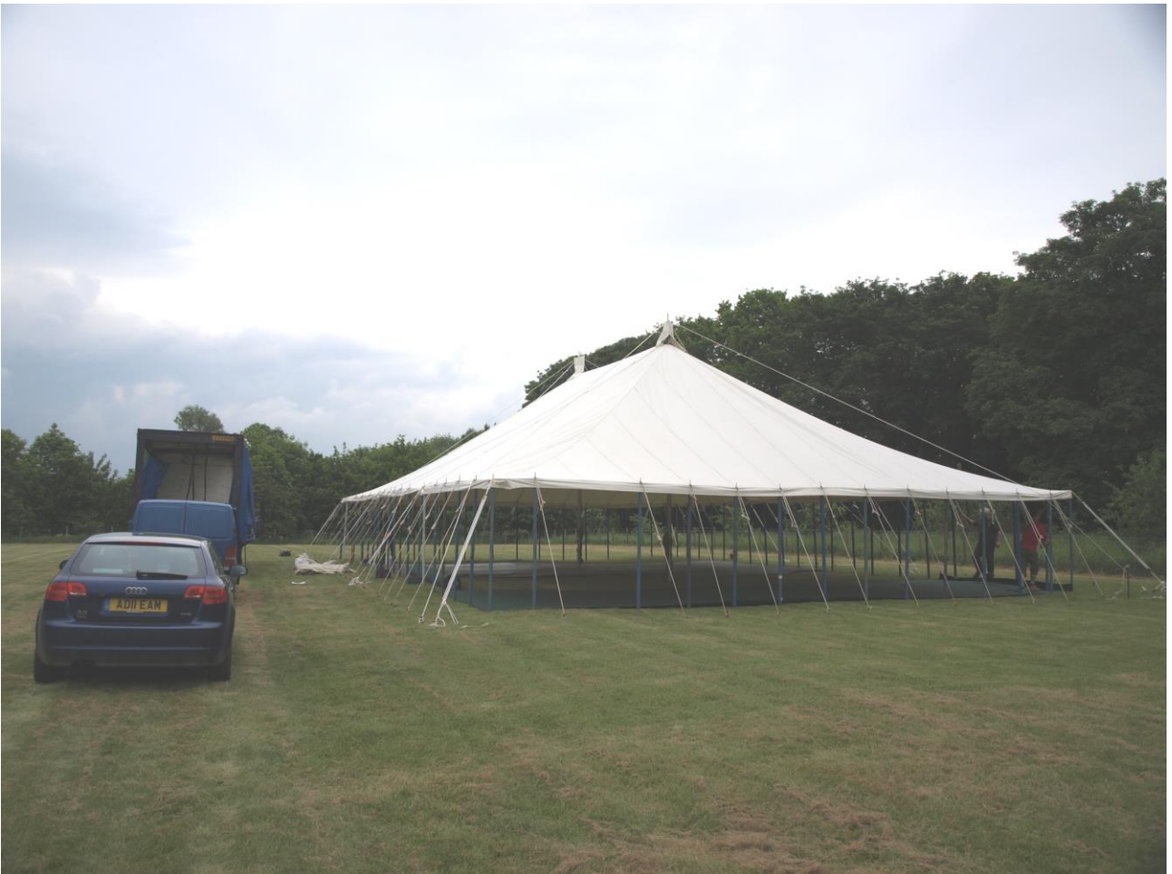
Erecting the marquee in the Festival Meadow