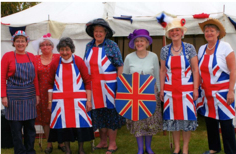
Toft ladies serving fine fare at the Royal Wedding Celebrations

By about 4.30 pm people began to drift away home after such a pleasant afternoon. Celebrations continued in the evening with a free concert in the Peoples Hall at 8pm. A variety of musicians were present: Toft Session, Comberton and Toft Ceol Galore and African Drums. A very varied and enjoyable day and a time to remember the Royal Wedding by was had by all.