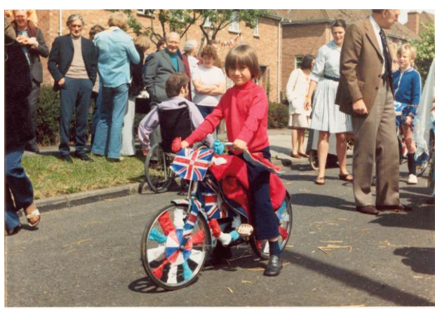
Decorated Bile competition