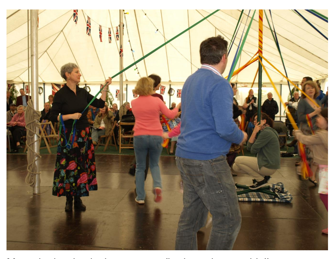
Maypole dancing in the marquee (bad weather outside!)