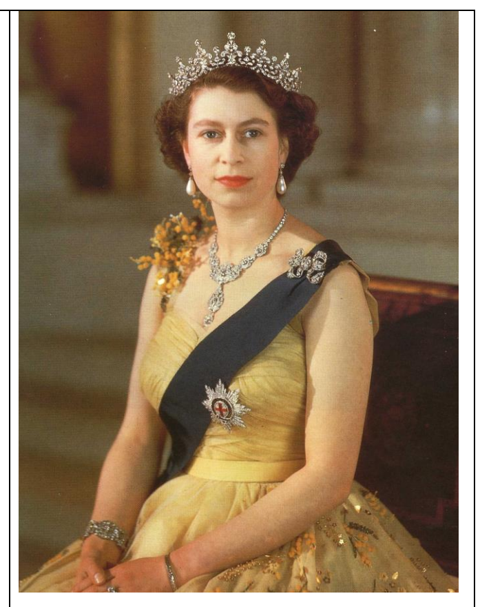
HM Queen Elizabeth II