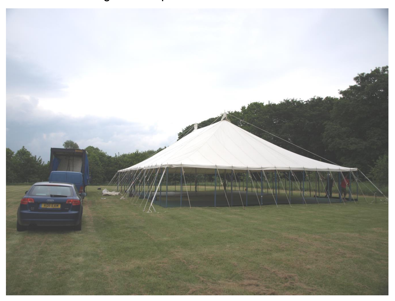
Erecting the marquee in the Festival Meadow