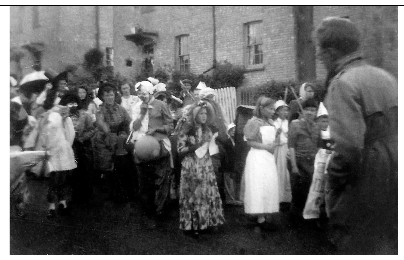
Toft Coronation parade