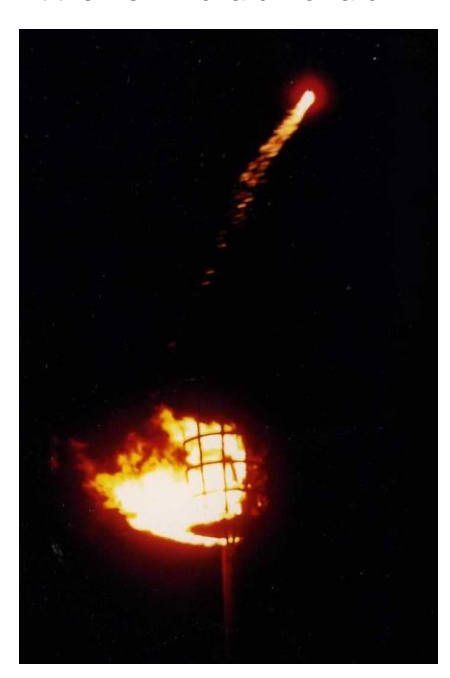
The Toft beacon lit, and rocket