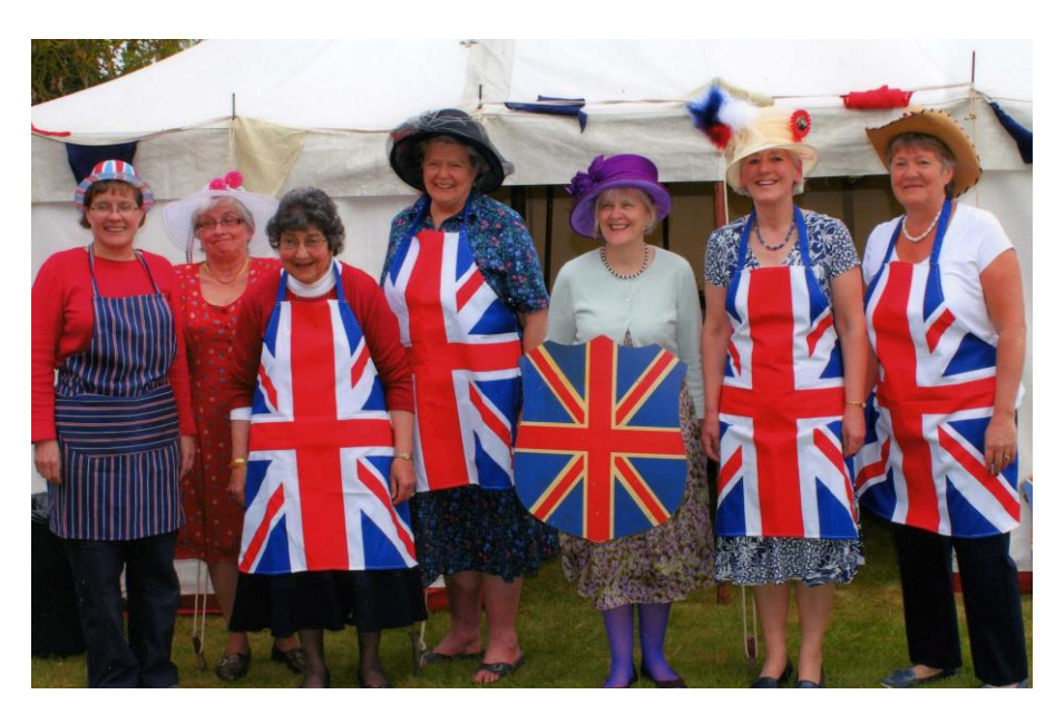
Toft ladies serving fine fare at the Royal Wedding Celebrations

By about 4.30 pm people began to drift away home after such a pleasant afternoon. Celebrations continued in the evening with a free concert in the Peoples Hall at 8pm. A variety of musicians were present: Toft Session, Comberton and Toft Ceol Galore and African Drums. A very varied and enjoyable day and a time to remember the Royal Wedding by was had by all.