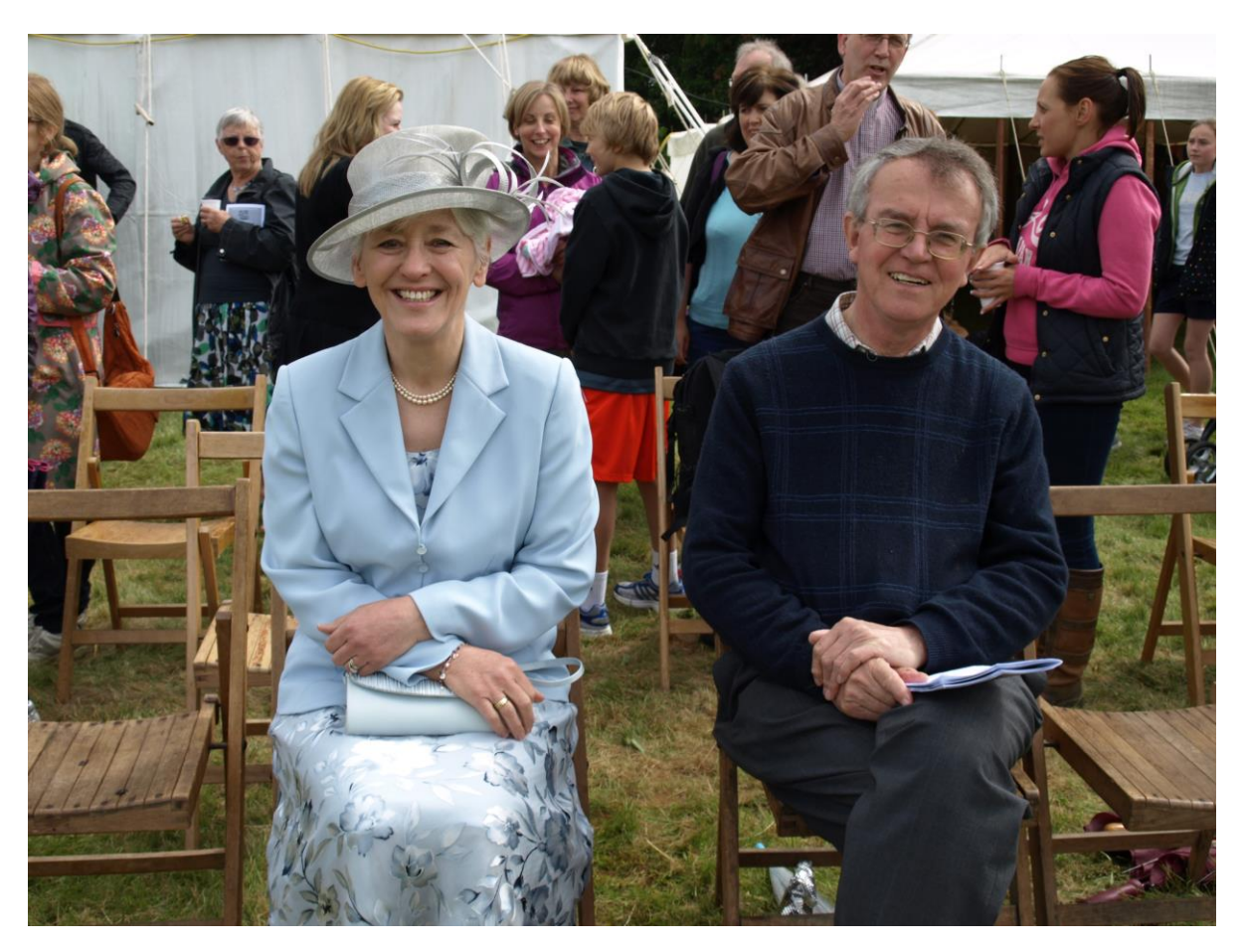
"The Queen" attends the Sports Day