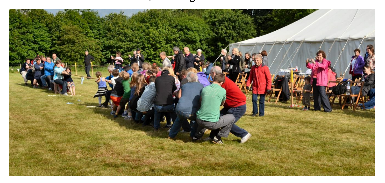
Tug-o-war at the Sports Day