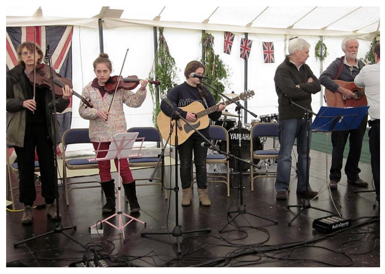
Toft Session musicians at the Variety Show