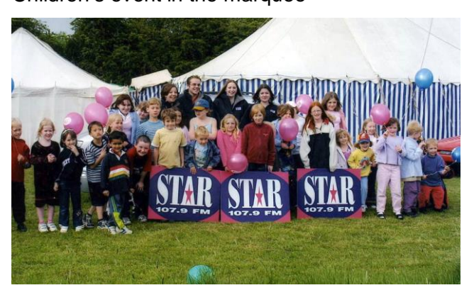
Star Bug Radio