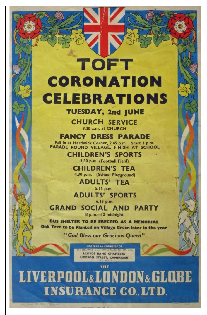
Toft Coronation poster

age of widespread car ownership. Today's travellers still, nonetheless, enjoy the convenience of the shelter, at a time of reestablished significance for public transport.