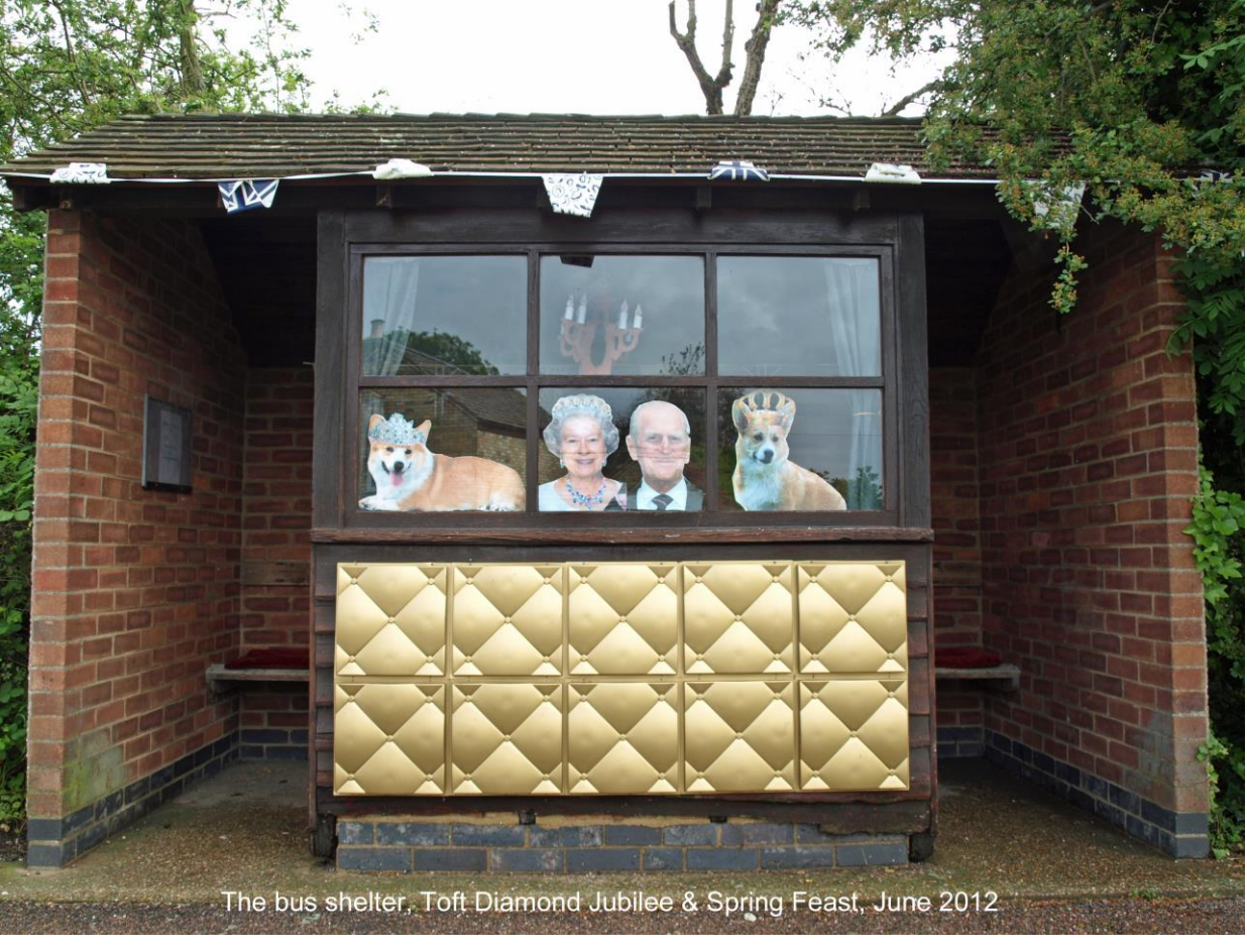
The bus shelter decorated