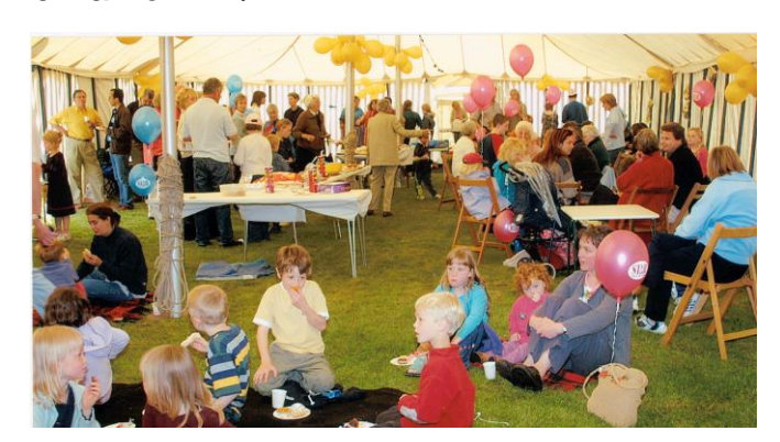
Children's event in the marquee

I would like to add a picture of the jubilee pennant if possible – picture 1 of email on 24/11