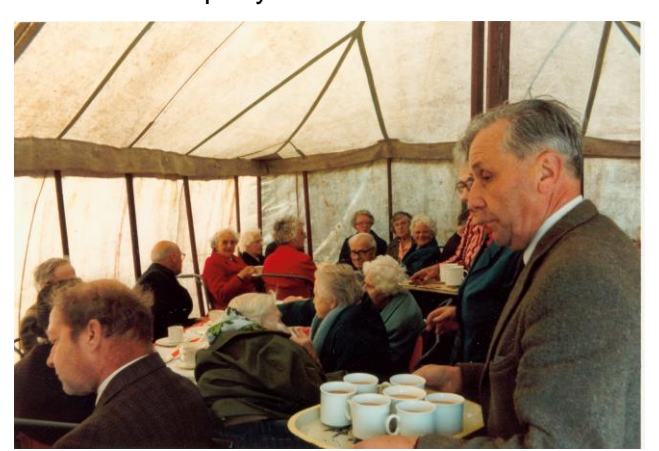
Tea-party for the old folk