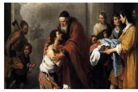
Theme: "The Prodigal Love of the Father"

Please invite your friends and family members to join us in this Novena.