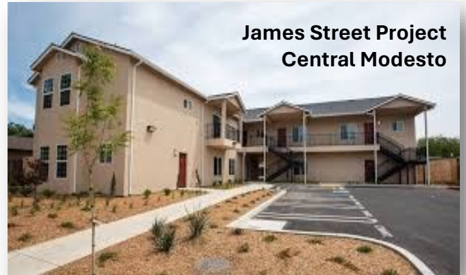
James Street Project Central Modesto