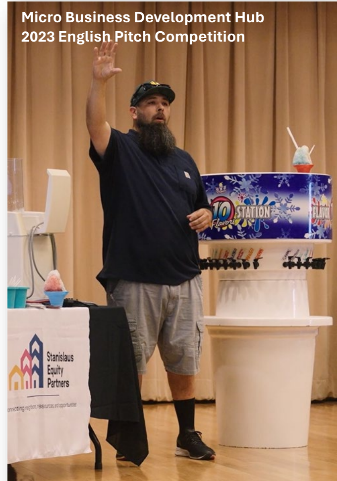
Micro Business Development Hub 2023 English Pitch Competition

Raised from local public and private sources