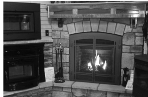
Fireplace Shop: Wood & Gas