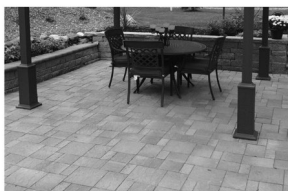
Brick Paver Supplies