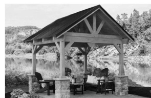
Pavilions & Pergolas