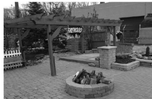
Decorative Brick Patios & Fire Pits