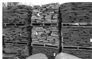
Brick & Stone Yard