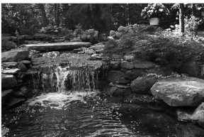
Pond & Fountain Shop