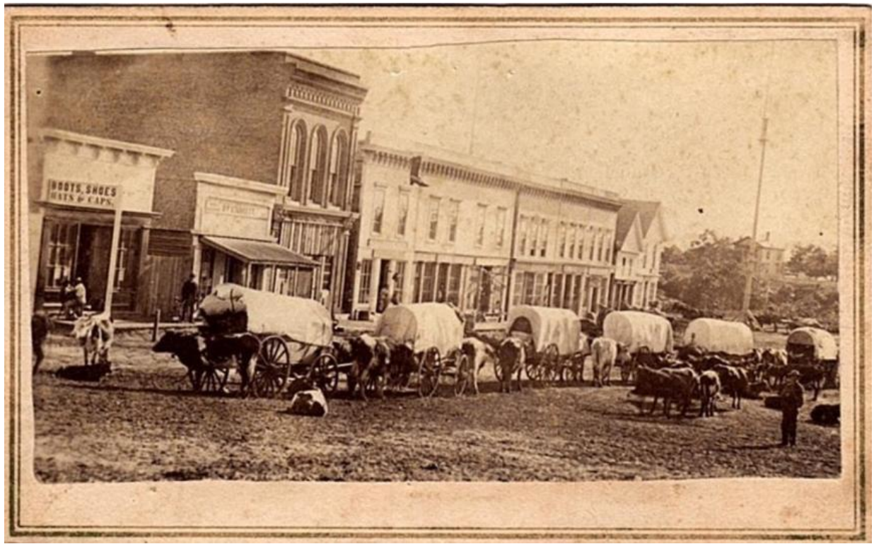
A Sizable Wagon Train Heading West Toward The New Frontier

The 1840 Census shows that population gains have been recorded all five regions of the country since 1820 – with the greatest by far in the Northwest and Southwest regions.