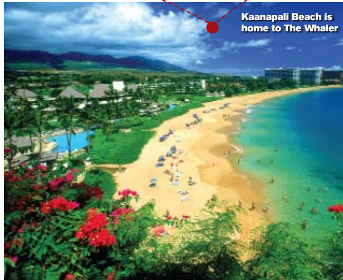
Kaanapali Beach is home to The Whaler