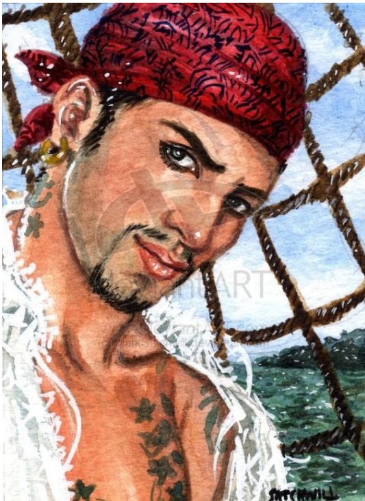
Would you trust this “rascal” running your government and making choices for you?

As I’ve written many times, one of the most fundamental differences between liberals and conservatives is the vision for the role of government in our lives. In reaching a personal opinion on this, you need to ask yourself: How much government control do I want to deal with vs. how much do I trust the ability of individuals to make reasonably wise choices and solve individual problems? It’s not black and white, and it’s not all or nothing – but it is a continuum that defines the tendencies of liberals on one side, and conservatives occupying the other side.