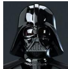
Just like Darth Vader, individuals have a "dark side."

If men were angels, no government would be necessary. – James Madison