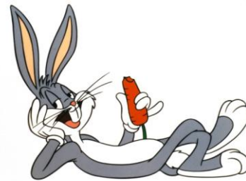
Guarding against "rascals"! Bugs Bunny – Now there's a rascally character!