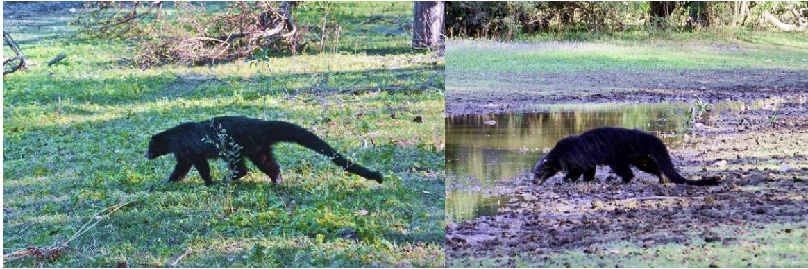
Figure 3. Binturong Arctictis binturong released in Bhutanghat block under Mainabari Beat of North Rydak Range, BTR.