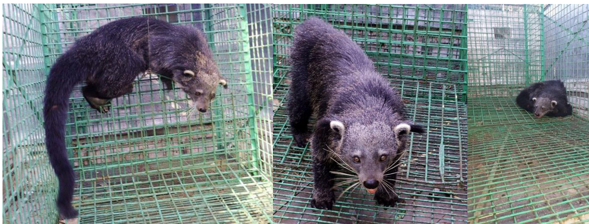
Figure 2. Binturong Arctictis binturong trapped at Paschim Khalisamari village, Northern Bengal.