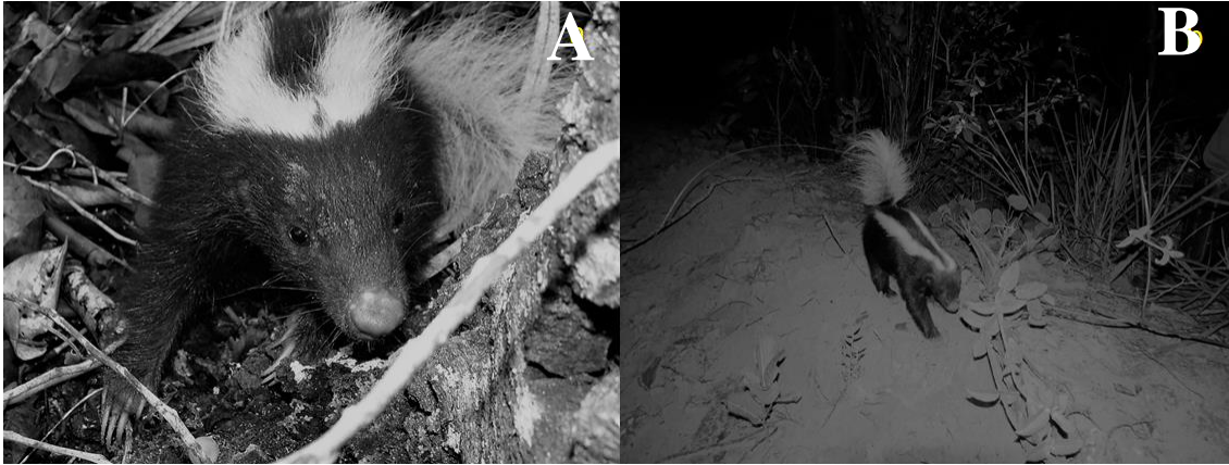
Figure 2. First records of the Striped Hog-nosed Skunk Conepatus amazonicus in the southeast of Mato Grosso state, Brazil. (A) Adult photographed in Alto Araguaia municipality (point#1), December 2009. C. Medolago; (B) Adult male in the Itiquira municipality (point #5), February 2013. L Camilo.

A second record correspond to an individual found dead on the December 3, 2009 at 11h30 along the road BR-364 within a fragment of woodland savanna, 10 km northwest of Alto Araguaia municipality ( 17^{\circ}15'44.82'' S, 53^{\circ}18'14.40'' W, altitude 740 m, point # 2; Figure 1). The third record was made through the direct observation of an adult individual on the December 9, 2009 at 21h00 in a woodland savanna, 12.5 km west of the left bank of the Araguaia river ( 17^{\circ}26'32.90'' S, 53^{\circ}20'38.35'' W, altitude 748 m, point # 3; Figure 1). Another specimen was found on the October 10, 2012 on road BR-364, 4.5 km northwest of Jaciara municipality ( 15^{\circ}55'36.45'' S, 55^{\circ}01'23.01'' W, altitude 482 m, point # 4; Figure 1), where the road crosses a matrix of cattle pastures, woodland savanna and semi-deciduous forest.