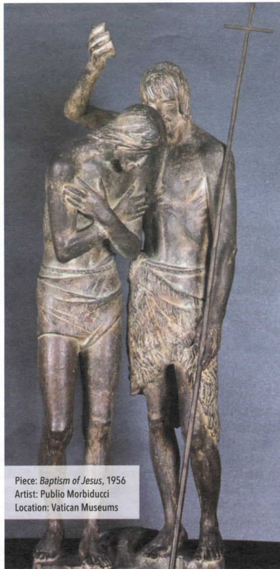
Piece: Baptism of Jesus , 1956 Artist: Publio Morbiducci Location: Vatican Museums

Am I courageous enough to ask the Holy Spirit to come down and touch my soul with his fire?