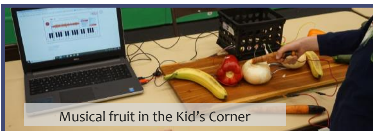
Musical fruit in the Kid’s Corner

The Kid’s Corner had a new activity this year involving musical fruit which delighted children and adults alike and the Petting Zoo of barnyard buddies was a crowd pleaser.