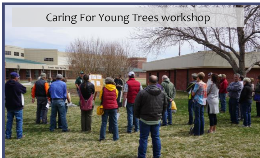
Caring For Young Trees workshop