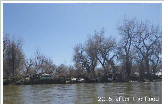
2016, after the flood