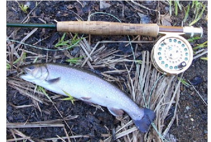
SNOW COVERED FERN ON A COLD MORNING