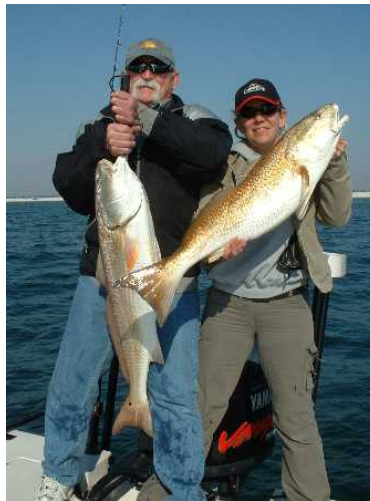
A FATHER & DAUGHTER WITH A PAIR OF NICE MARCH REDS....