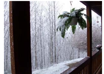
KEVIN, WE FOUND YOUR HAT!