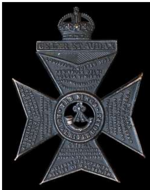
King's Royal Rifle Corps badge