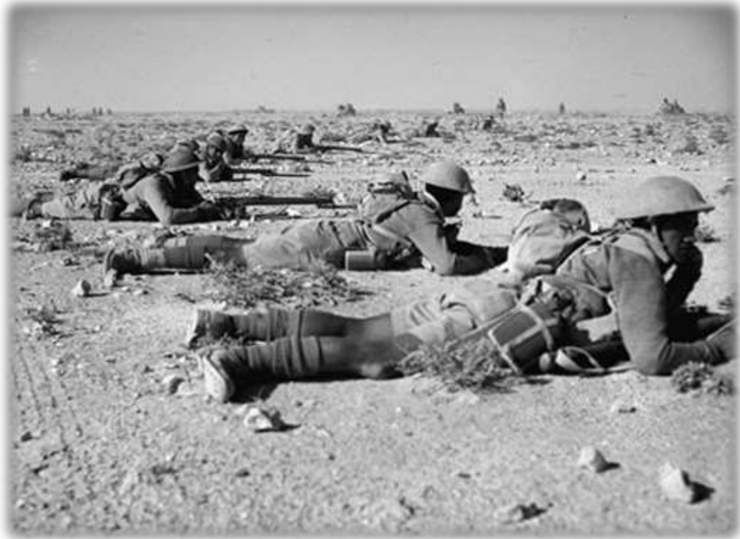
Allied troops at Sidi Rezegh

In spite of all possible resistance on the part of the riflemen in a hopeless struggle, the Battalion positions were overrun. Five officers and fifty other ranks, joined later by roughly another hundred, were all who escaped.